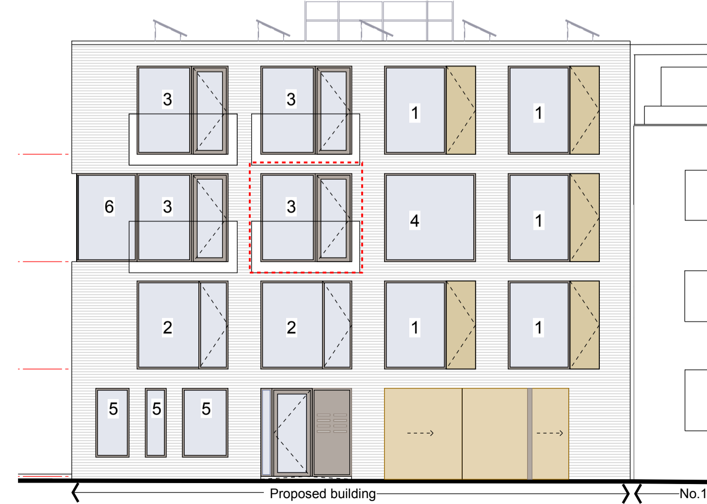
West Elevation, Ferdinand Street Scale 1:200 @ A3

© Lees Munday Ltd Figured dimensions only are to be taken from this drawing. All dimensions are to be checked on site before any work is put in hand.