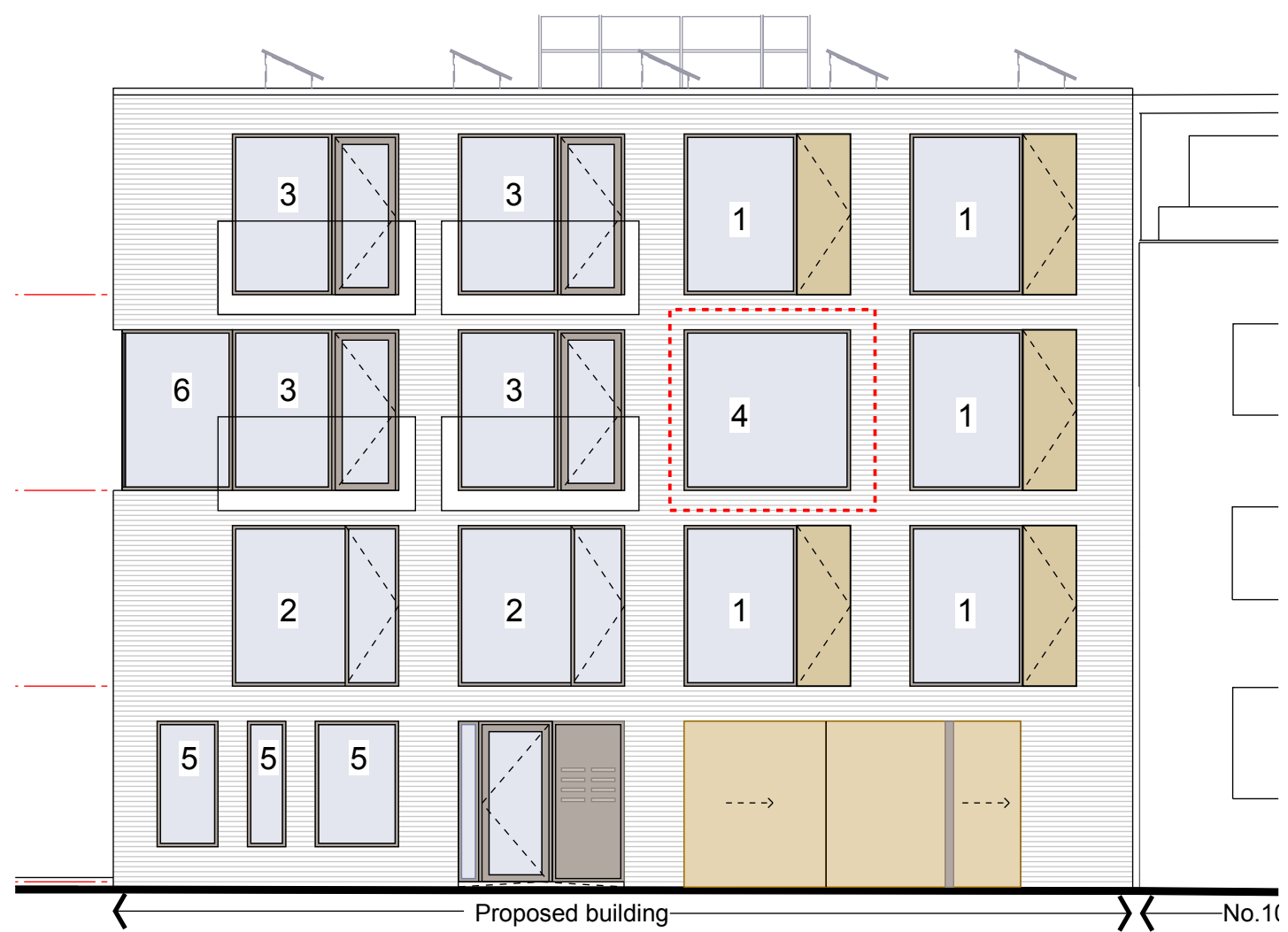
West Elevation, Ferdinand Street Scale 1:200 @ A3

© Lees Munday Ltd Figured dimensions only are to be taken from this drawing. All dimensions are to be checked on site before any work is put in hand.