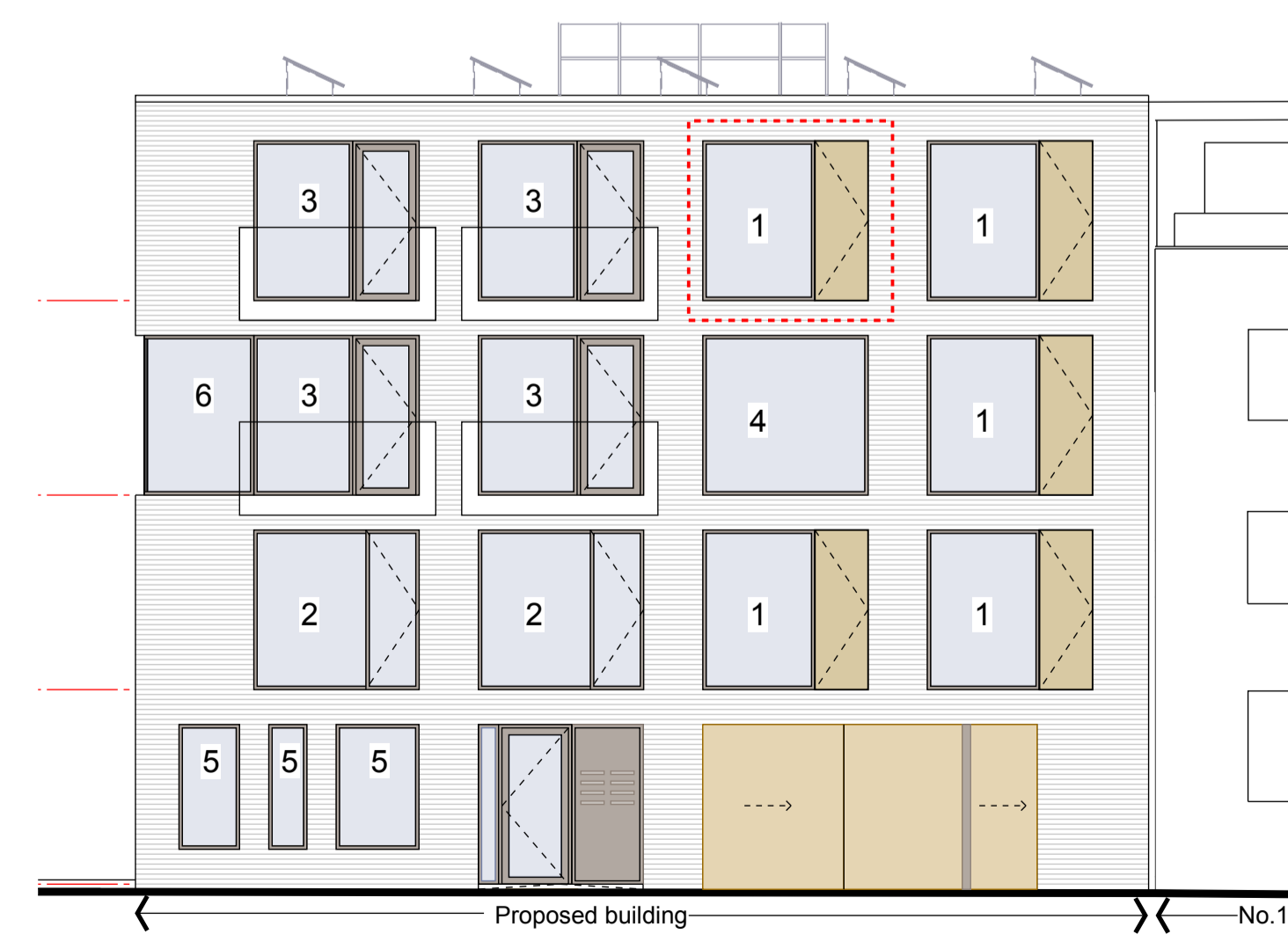
West Elevation, Ferdinand Street Scale 1:200 @ A3

© Lees Munday Ltd Figured dimensions only are to be taken from this drawing. All dimensions are to be checked on site before any work is put in hand.