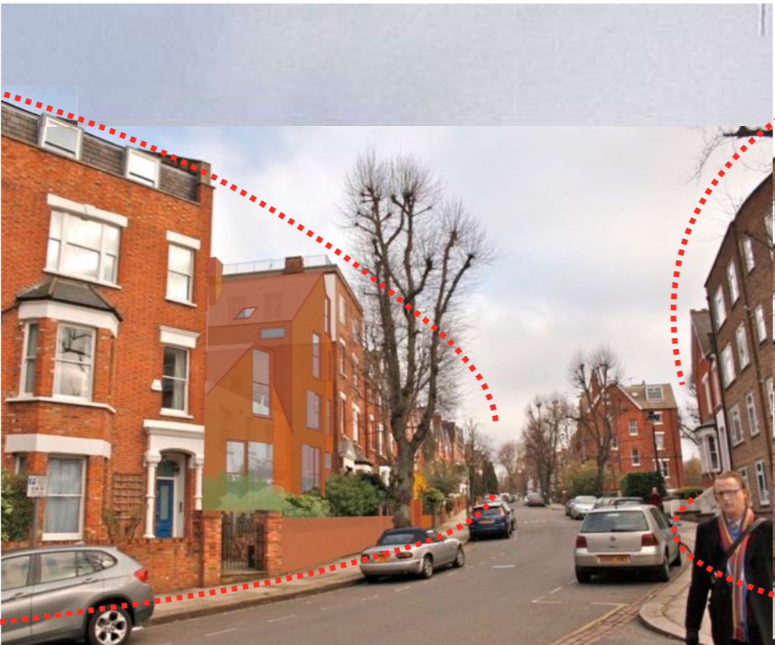
View of the Proposed House at 15a Parliament Hill