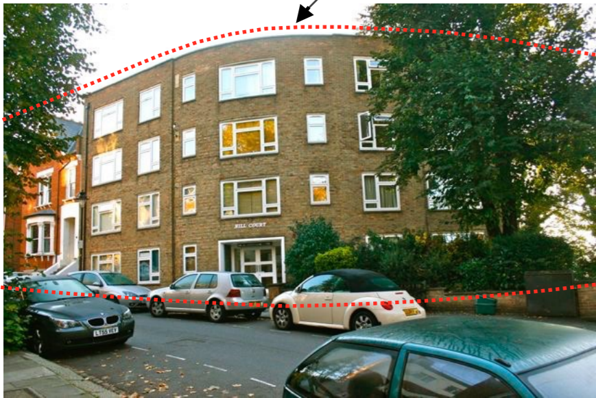
Hill Court stands directly opposite 15a Parliament Hill

The layout of the conservation area is unusual and contains a number of curved streets. This reflects both the topography and the island-of-houses-within-the-Heath constraints of the community where in some cases the streets double back on themselves. This curve in the streets is reflected in building elevations which either step in facets, or in a few cases are themselves actually curved. The resulting elevations are unusual and this is an important characteristic of the urban fabric of the conservation area. The proposed new house at 15a Parliament Hill sits on a shallow curve and the elevation follows this curving pattern with facets. The facets also have a very slight accordion-like form which gives slight bow to the elevation. This is a contemporary version of the common bay window form found throughout the conservation area.