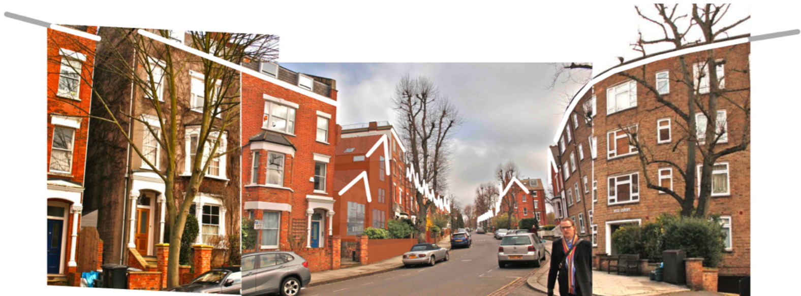
Collage View Looking North up Parliament Hill The change from flat parapets and mansards to pitched gable ends is highlighted.

The pitched gable end form, and the gentle sweep, and slight accordion projection of the proposed front elevation to the new house at 15a Parliament Hill establish formal and architectural connections to the surrounding buildings. The curve of the mansion block opposite, the pitched gable end forms of the terraces beyond, and the projection of window bays are all reflected in the new house. These formal correspondences link and order the relatively disparate fabric of the immediate setting.