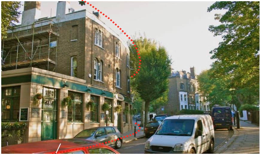
Magdalen Pub at the entry to South Hill Park