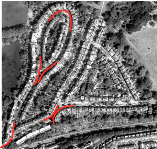
Satellite image of the conservation area: The curved streets and elevations are highlighted.

The layout of the conservation area is unusual and contains a number of curved streets. This reflects both the topography and the island-of-houses-within-the-Heath constraints of the community where in some cases the streets double back on themselves. This curve in the streets is reflected in building elevations which either step in facets, or in a few cases are themselves actually curved. The resulting elevations are unusual and this is an important characteristic of the urban fabric of the conservation area. The proposed new house at 15a Parliament Hill sits on a shallow curve and the elevation follows this curving pattern with facets. The facets also have a very slight accordion-like form which gives slight bow to the elevation. This is a contemporary version of the common bay window form found throughout the conservation area.