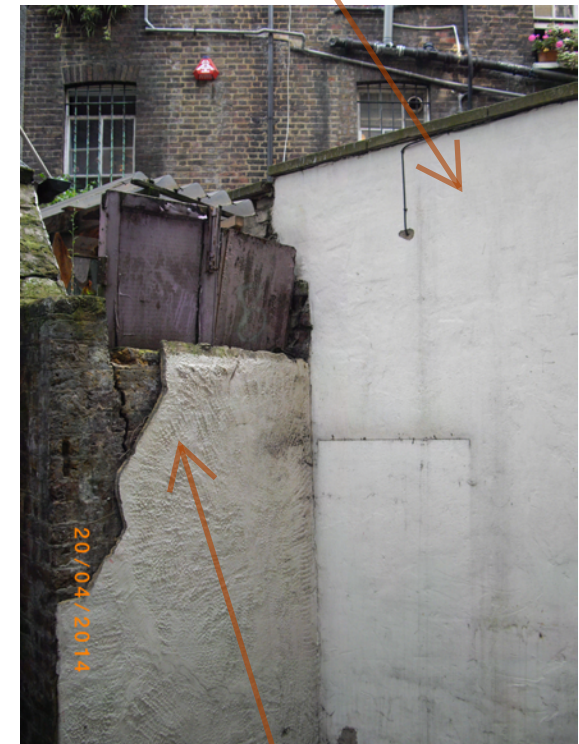
Increase wall height by approx 500mm