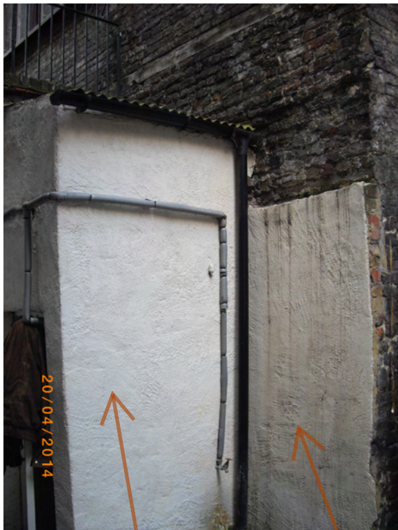
Rear 'out house'. Demolish structure