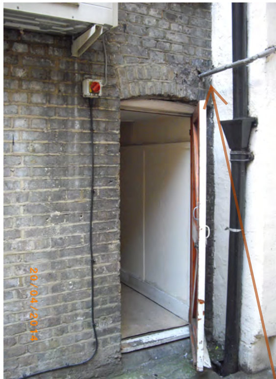
Junction with rear of 61 Neal St