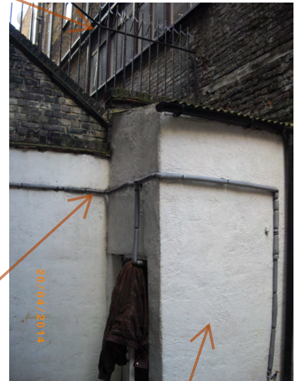
Out house to be demolished