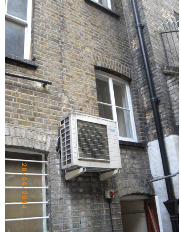
REAR ELEVATION (of 61 Neal Street) Sectional Elevation DD