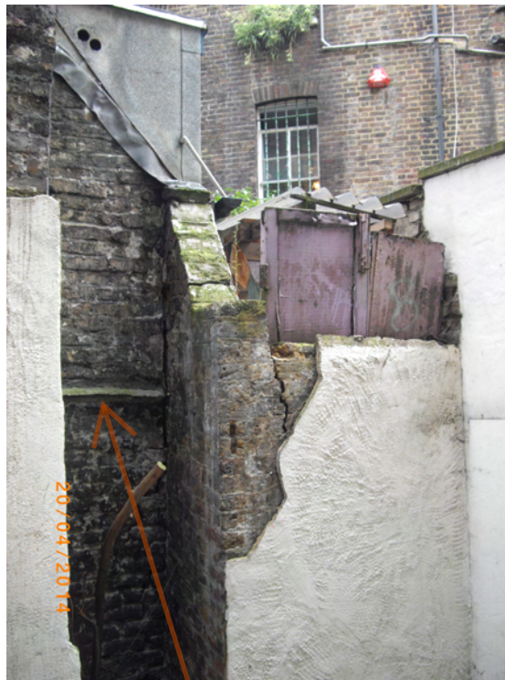
Recessed area in rear wall. Brick up recess with brick wall to match.