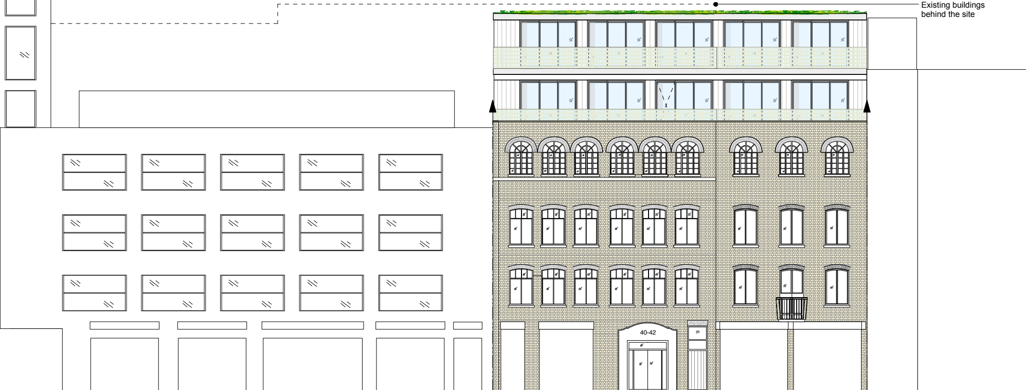
Existing buildings behind the site