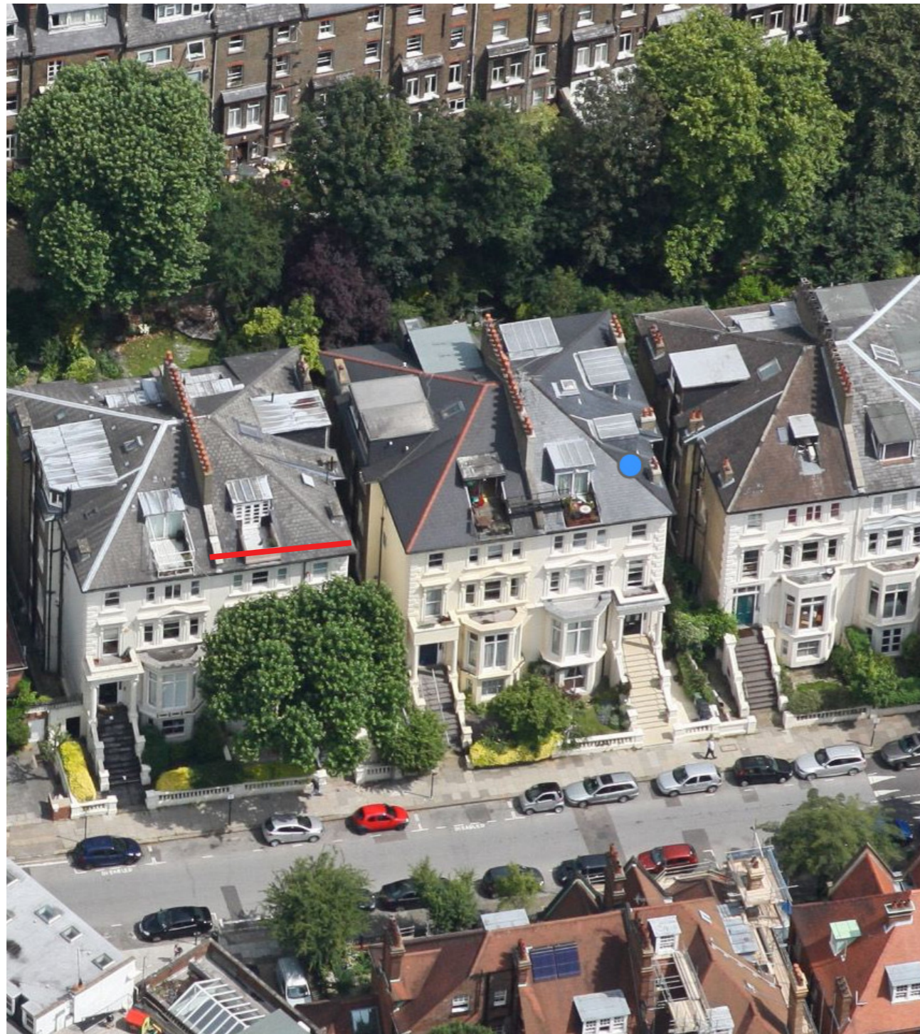
Aerial photographs of street elevation - no. 64 Belsize Park Gardens highlighted with red line