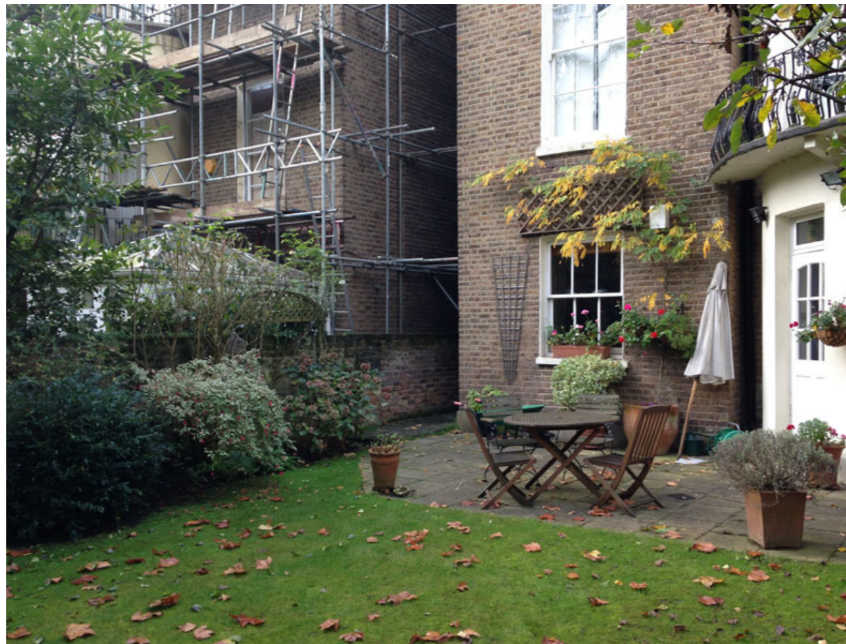
Rear garden of no. 64 Belsize Park Gardens