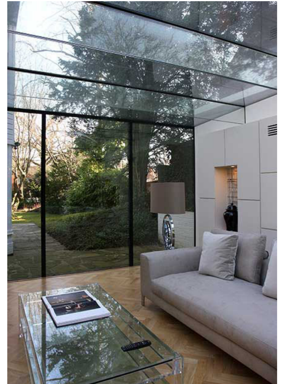
Reference images of similar all-glass extensions - external and interior views