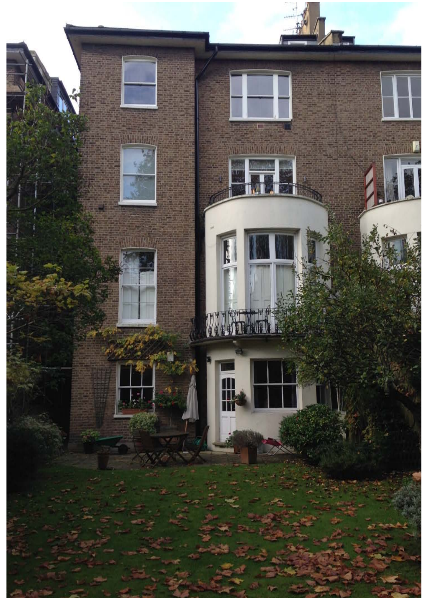
Rear elevation of no. 64 Belsize Park Gardens