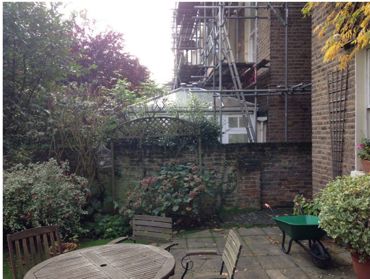
Rear patio area looking towards conservatory extension of no. 66 Belsize Park Gardens