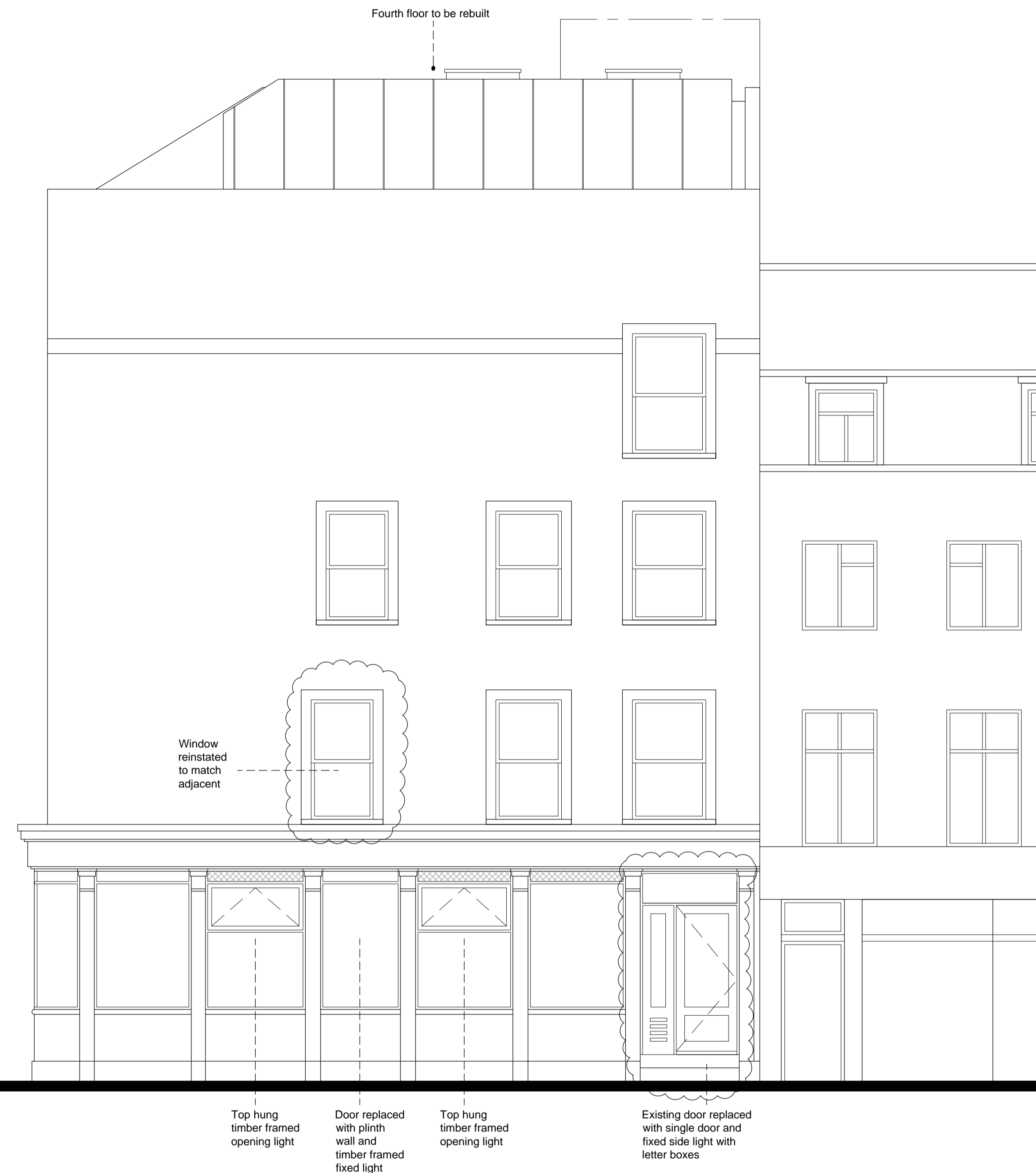
CLEVELAND STREET ELEVATION

NB: Drawing prepared for planning purpose from survey carried out by STH Surveys Ltd. ECE accepts no liability regarding the accuracy of the data provided. All dimensions to be checked on site prior to construction.