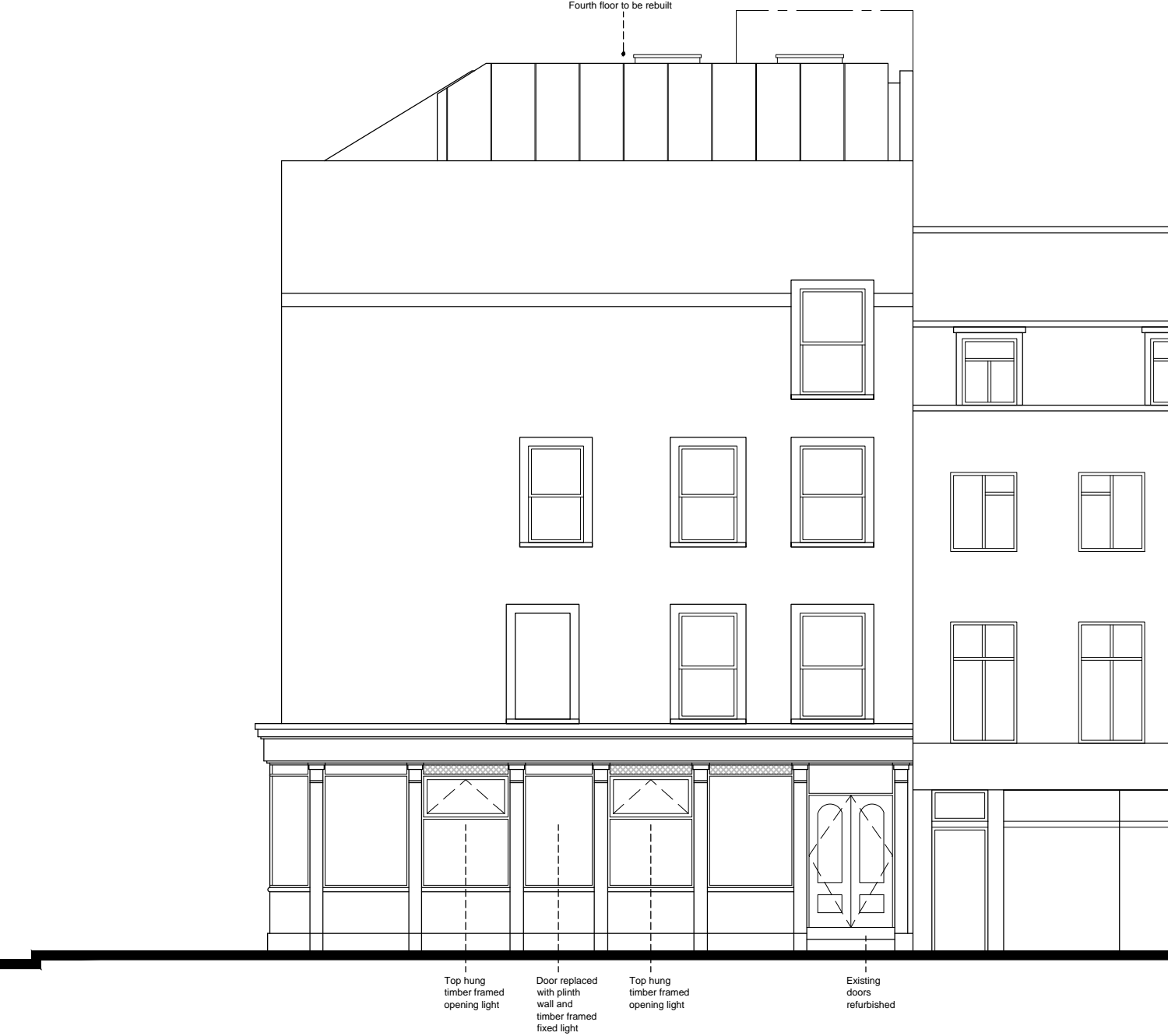
CLEVELAND STREET ELEVATION

NB: Drawing prepared for planning purpose from survey carried out by STH Surveys Ltd. ECE accepts no liability regarding the accuracy of the data provided. All dimensions to be checked on site prior to construction.