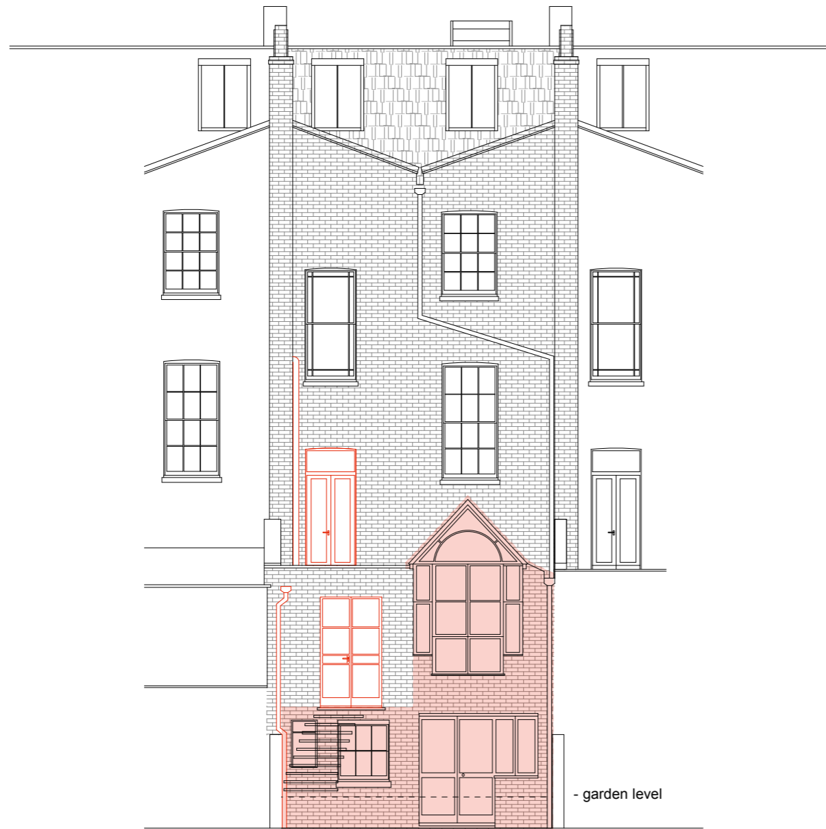
1 Existing Rear Elevation Scale: 1:100