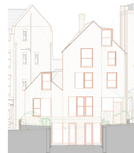
Proposed Cross Section through Light Well: The light well and windows bring natural light into the basement level. They are set out to follow the pattern of the main elevation above.