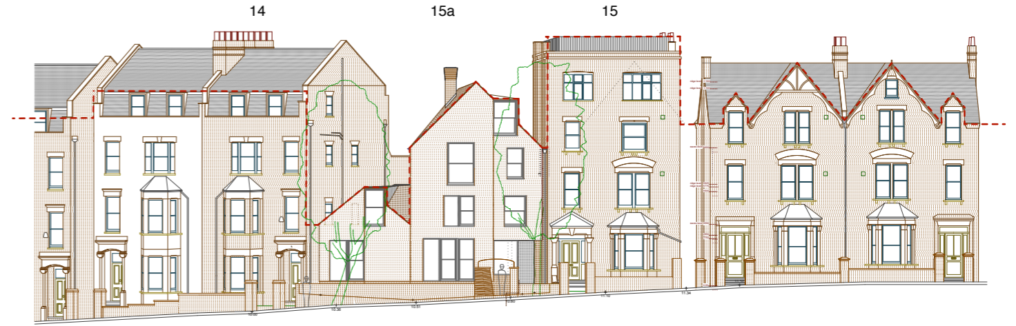
Long Front Elevation: The material and plane of the front elevation and the pitched roof profile provide contextual links to the larger terrace.