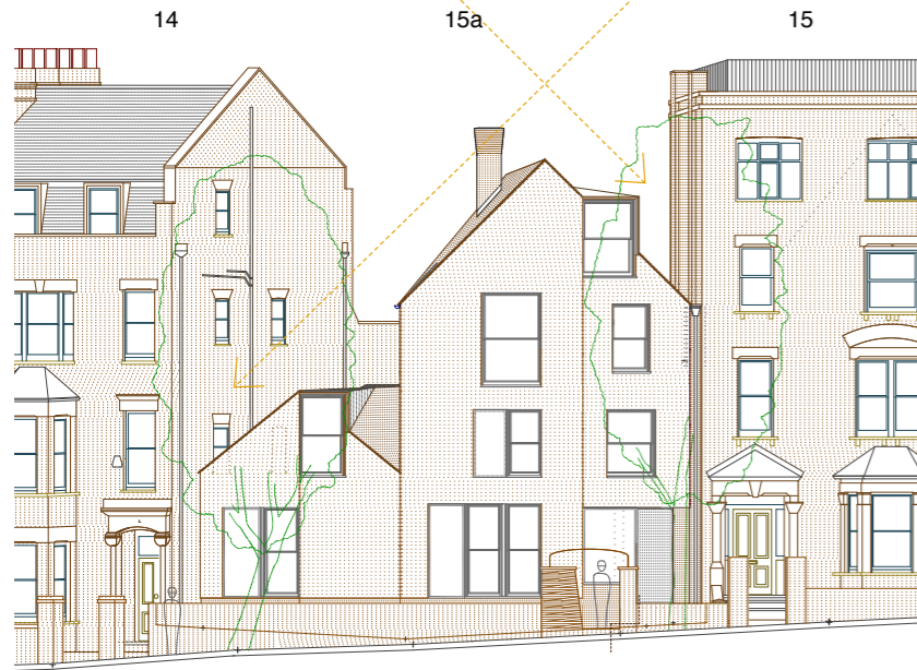
Proposed Front Elevation: The stepped, double pitched roof form responds to the shape of the site and allows light to the existing windows in the adjacent side elevations to 14 & 15.