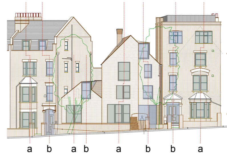
Fenestration Diagram: The structure of the window fenestration in relation to the common pattern in the conservation area.