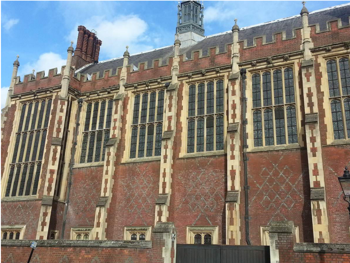
View of New Hall roof from ground level, West Elevation (3)