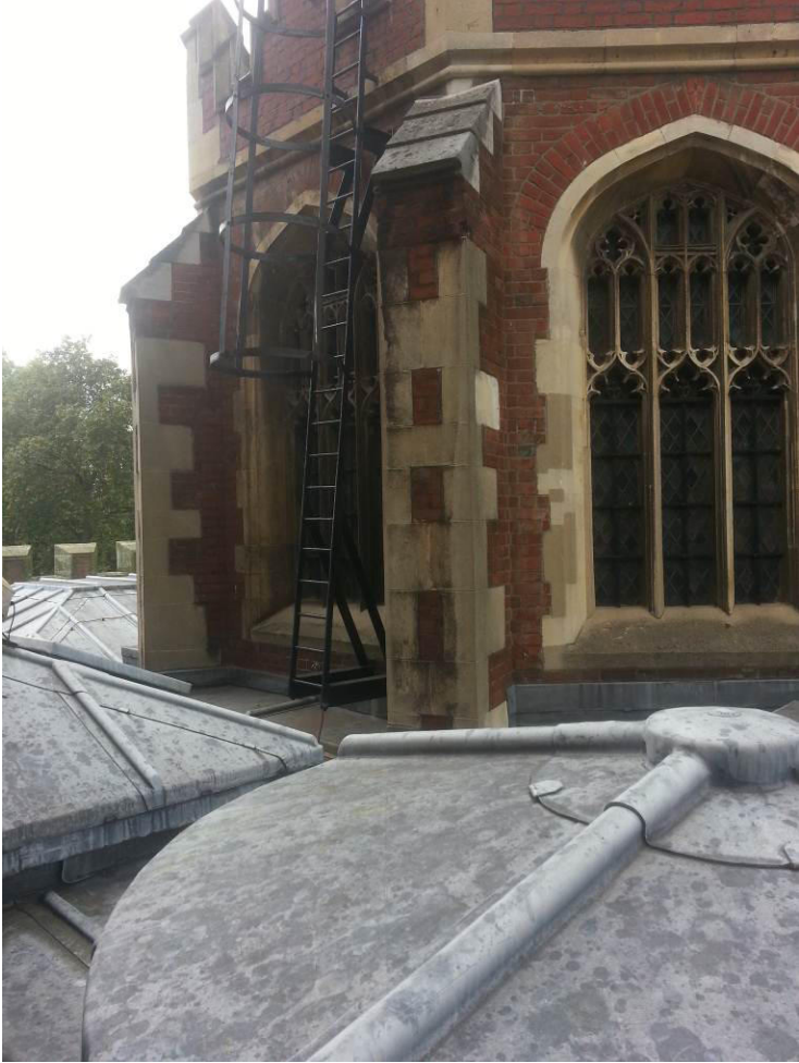
View of existing roof access ladders