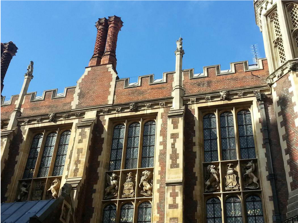
View of New Hall roof from ground level, West Elevation (1)