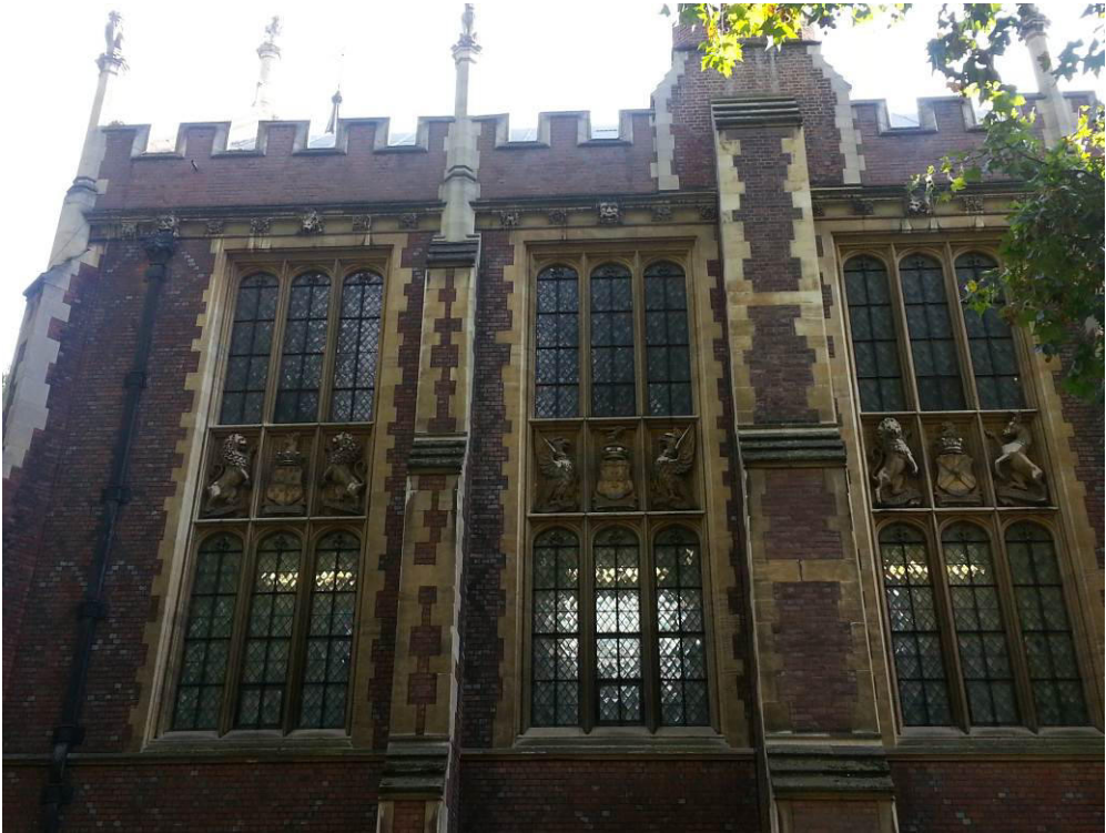
View of New Hall roof from ground level, East Elevation (2)