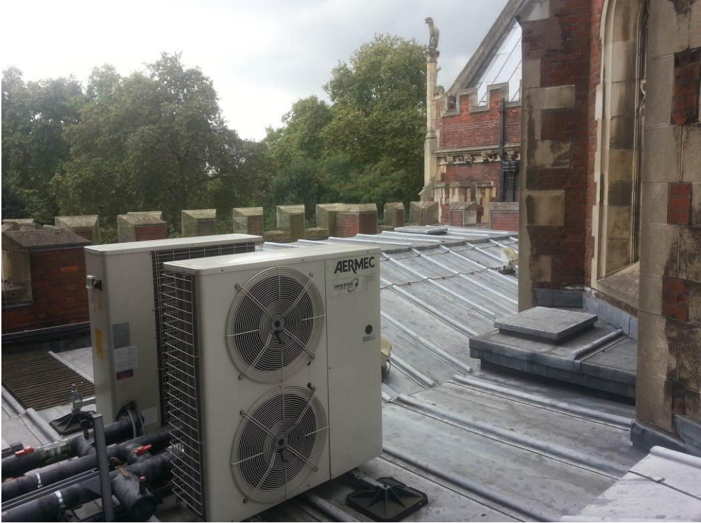
View of existing roof coverings