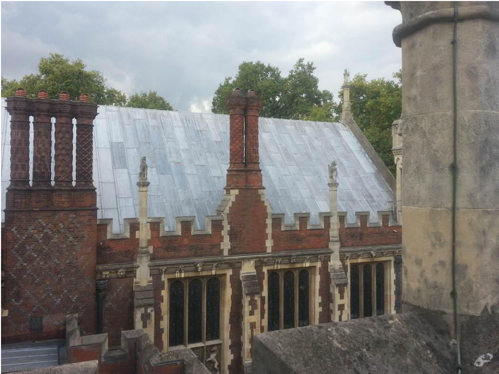
View of south elevation of library building