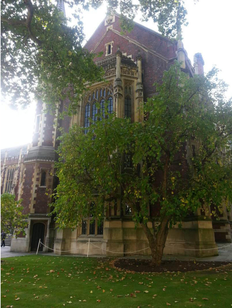
View of New Hall roof from ground level, East Elevation (3)