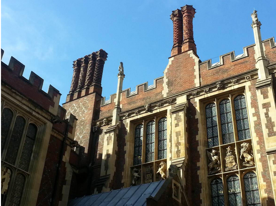
View of New Hall roof from ground level, West Elevation (2)