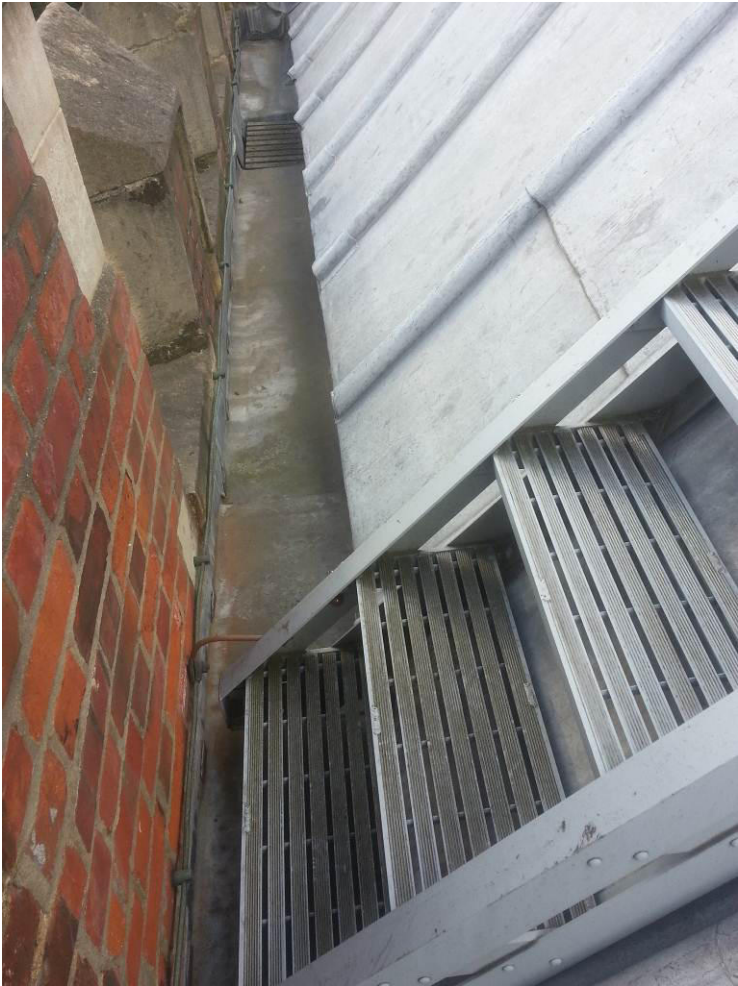
View of existing access ladders to library roof.