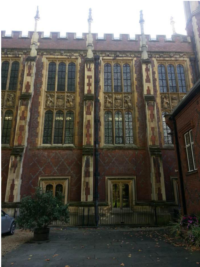
View of New Hall roof from ground level, East Elevation (1)