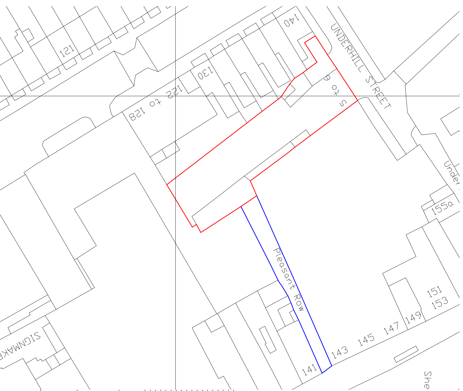
BLOCK PLAN @ 1:500