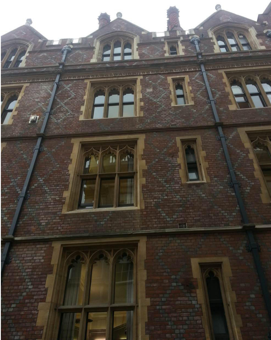
View of No.15 Old Square roof, from ground level