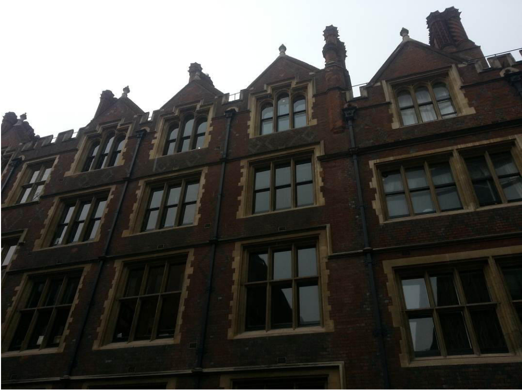
View of No.12 and 13 Old Square roof, from ground level (Chancery Lane elevation)