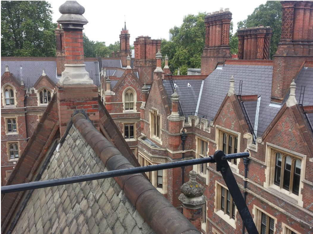
View of existing pitched roofs to 11-14 Old Square