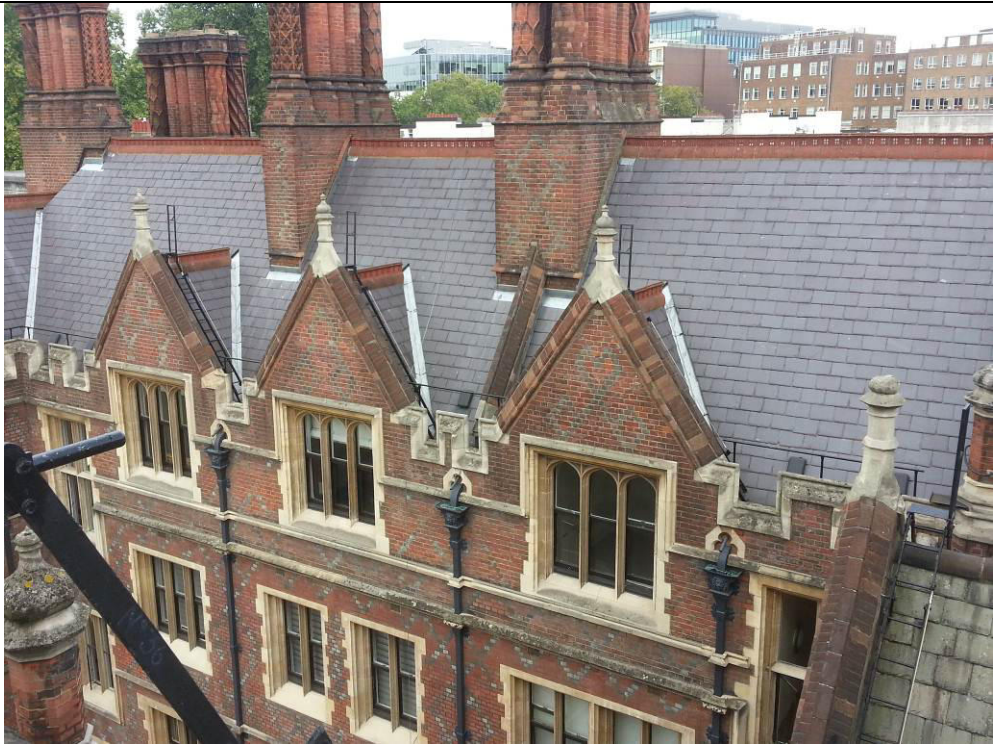
View of existing pitched roofs to 8-10 Old Square