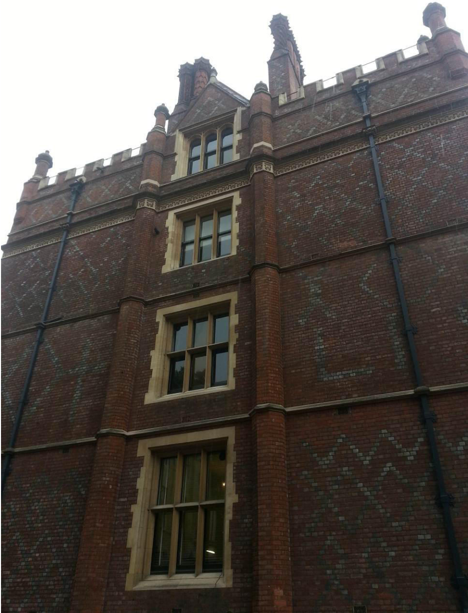
View of No.11 Old Square roof, from ground level (Chancery Lane elevation)