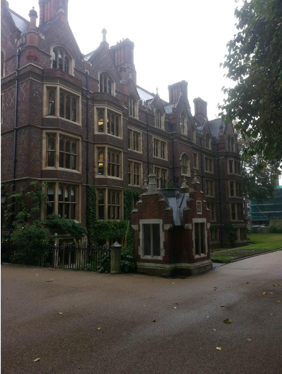
View of No.9-11 Old Square roof, from ground level rear elevations