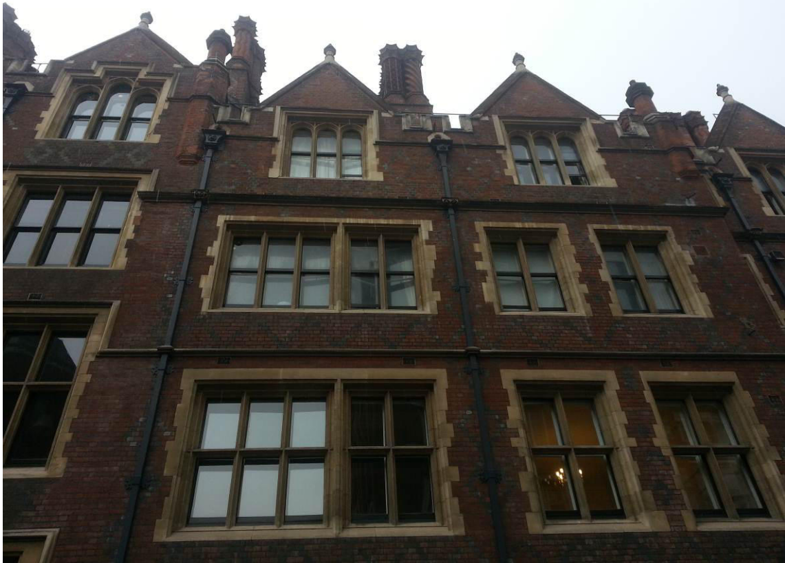
View of No.11 and 12 Old Square roof, from ground level (Chancery Lane elevation)