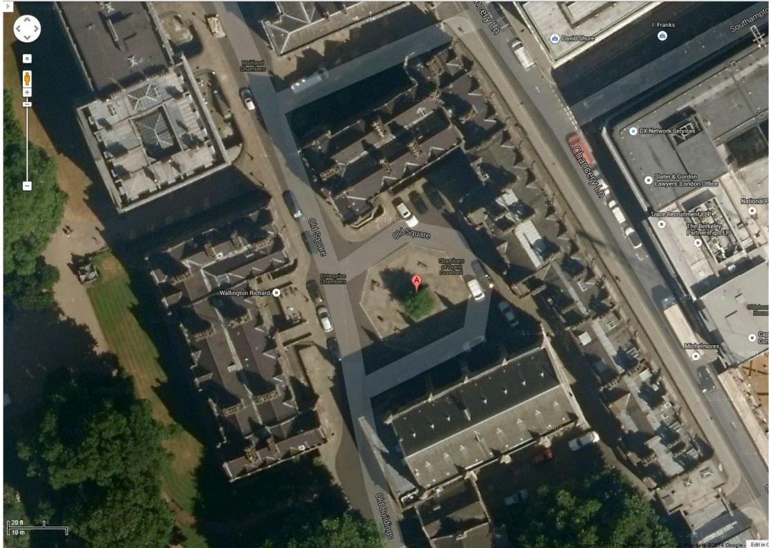
Lincoln's Inn Estate

Nos. 8-15 Old Square is located within Lincoln's Inn.