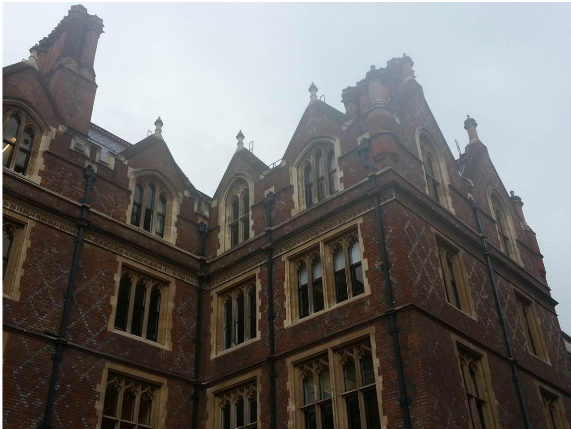
View of No.9 and 10 Old Square roof, from ground level.