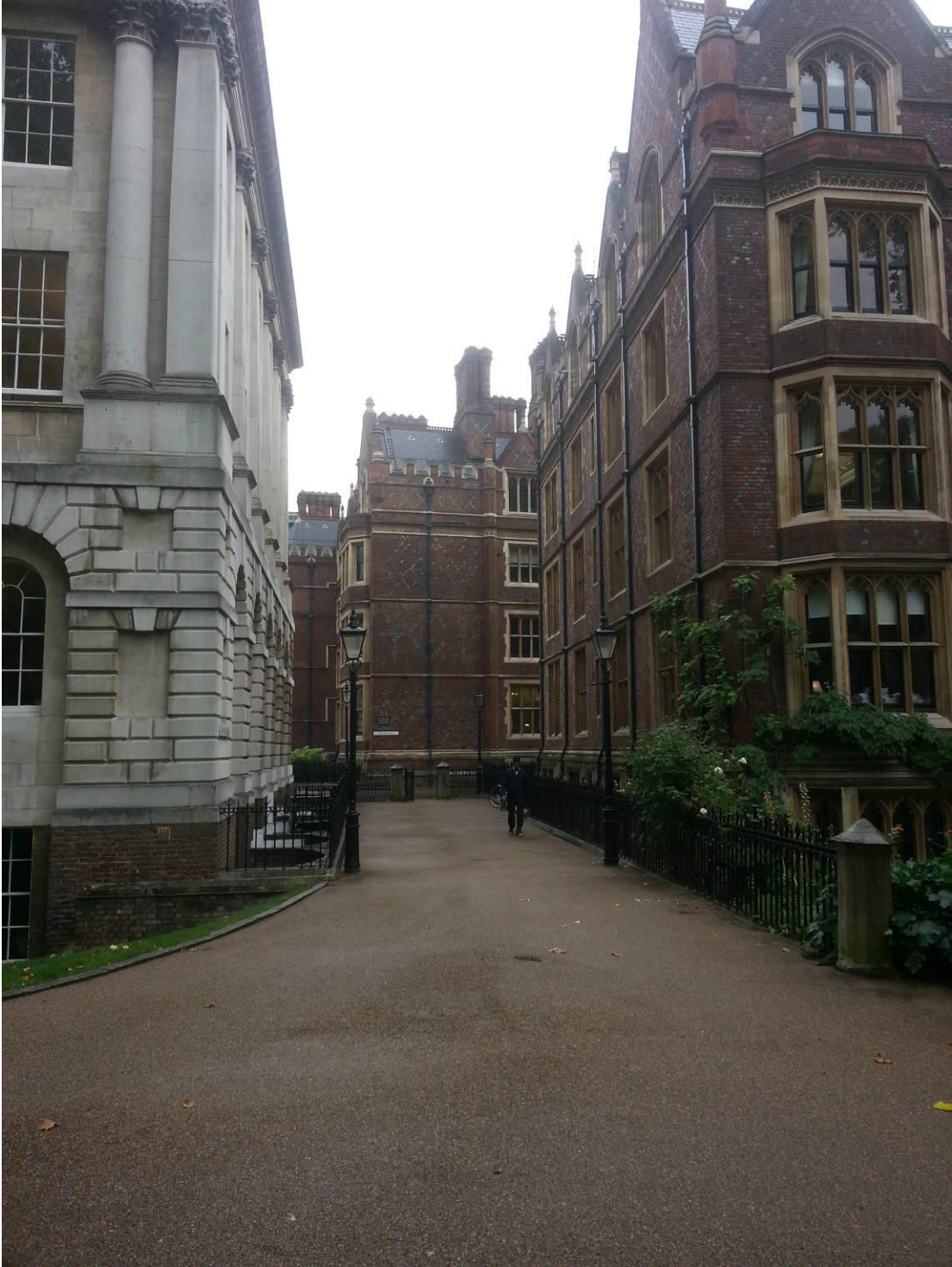
View of Nos. 10 and 15 from outside stone buildings.