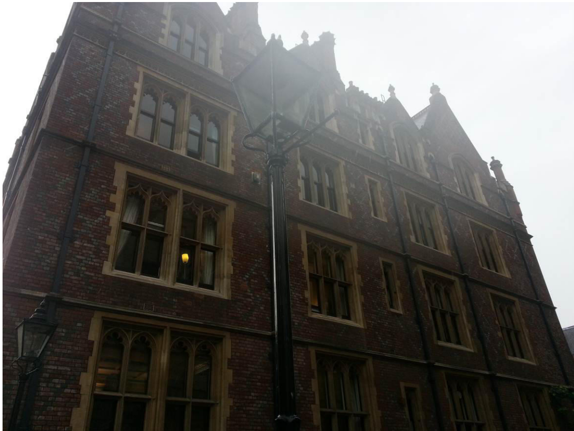
View of No.10 Old Square roof, from ground level.