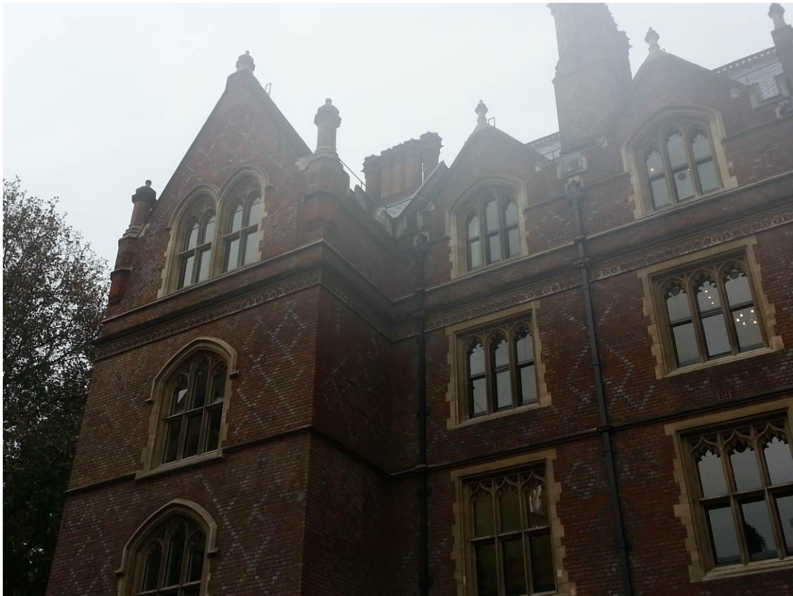
View of No.8 Old Square roof, from ground level.