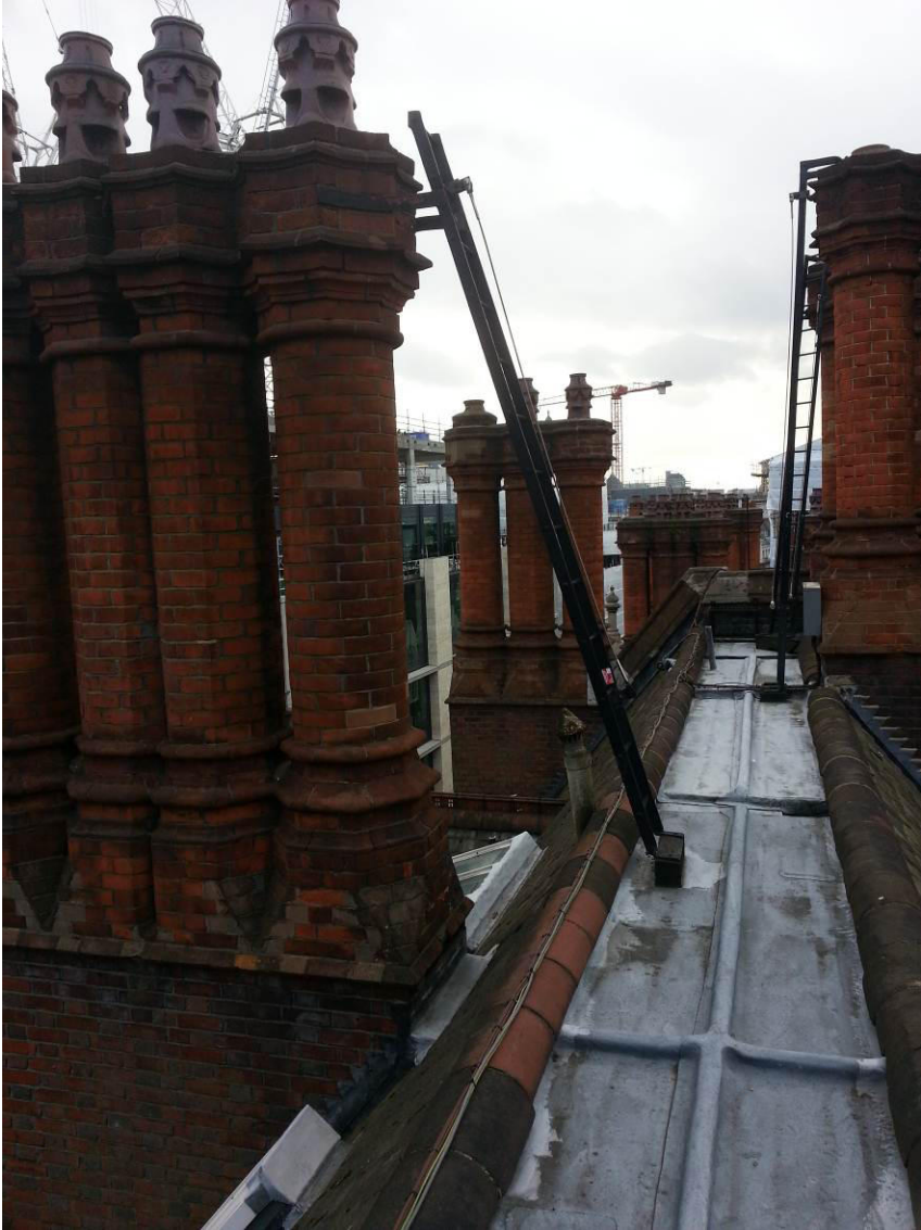
View of existing roof access ladders to chimney stack