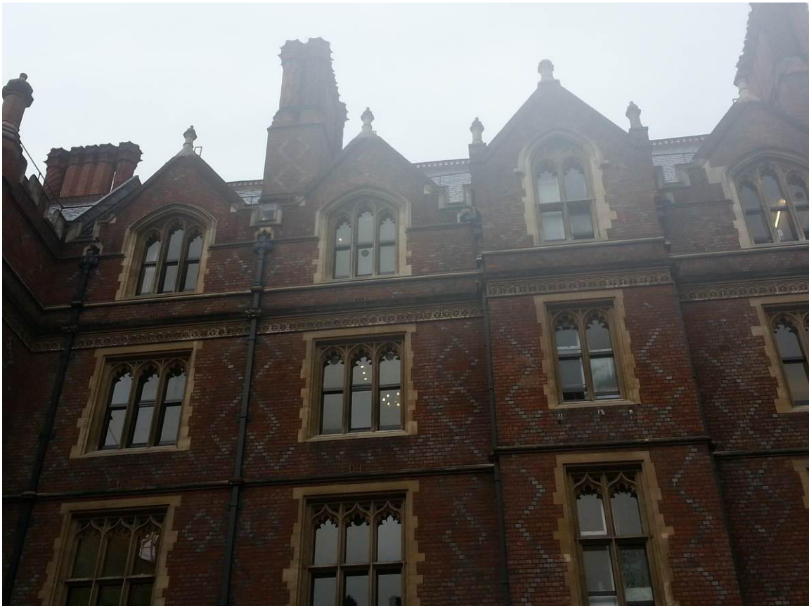
View of No.8 and 9 Old Square roof, from ground level.