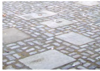
Existing paving in Eglon Mews