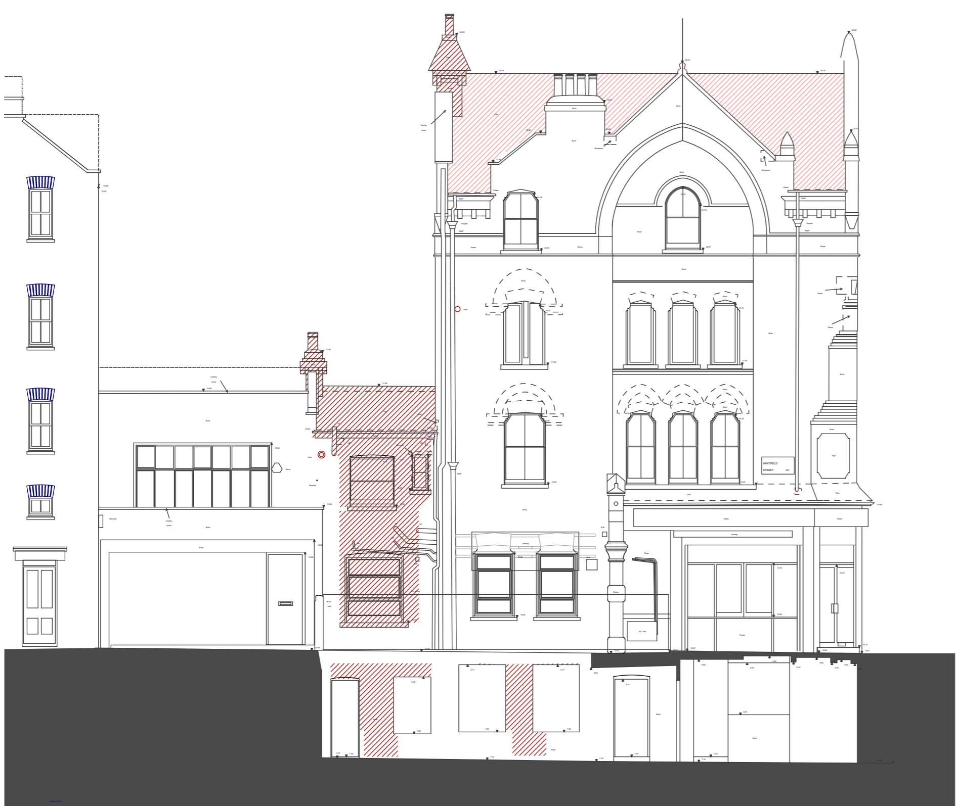
WHITFIELD STREET ELEVATION