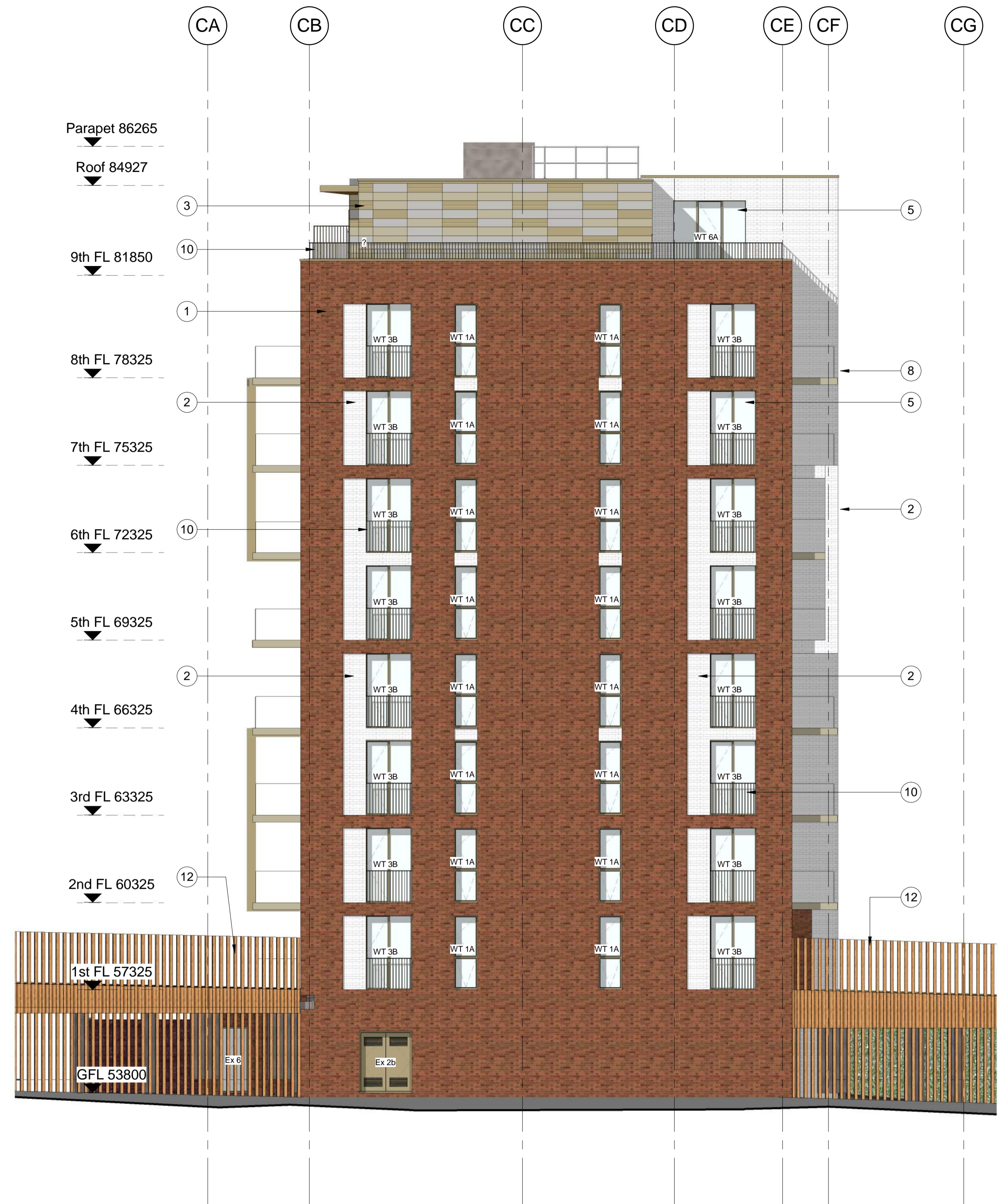
2 Block C North 1 : 100

© WCEC ARCHITECTS - DISCLAIMER This drawing is copyright and shall not be reproduced or used for any other purpose without the written permission of the architects. It is the contractors responsibility to ensure full compliance with the Building Regulations. Do not scale from this drawing, use figured dimensions only. It is the contractors responsibility to check and verify all dimensions on site. Any discrepancies to be reported immediately. IF IN DOUBT ASK. Materials not in conformity with relevant British or European Standards/Codes of practice or materials known to be deleterious to health & safety must not be used or specified on this project. Materials known to contain asbestos contaminated materials (ACM's) in the manufacture or installation process have not been specified and must not be used on this project.