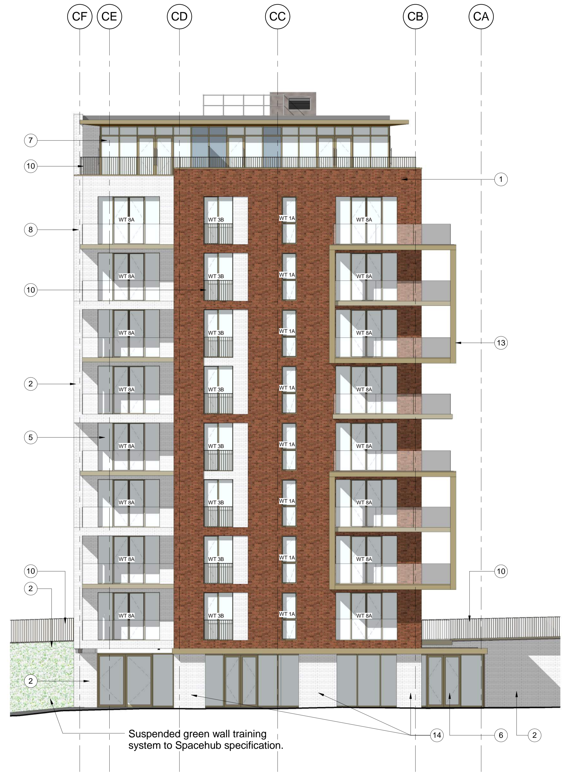
1 Block C South 1 : 100