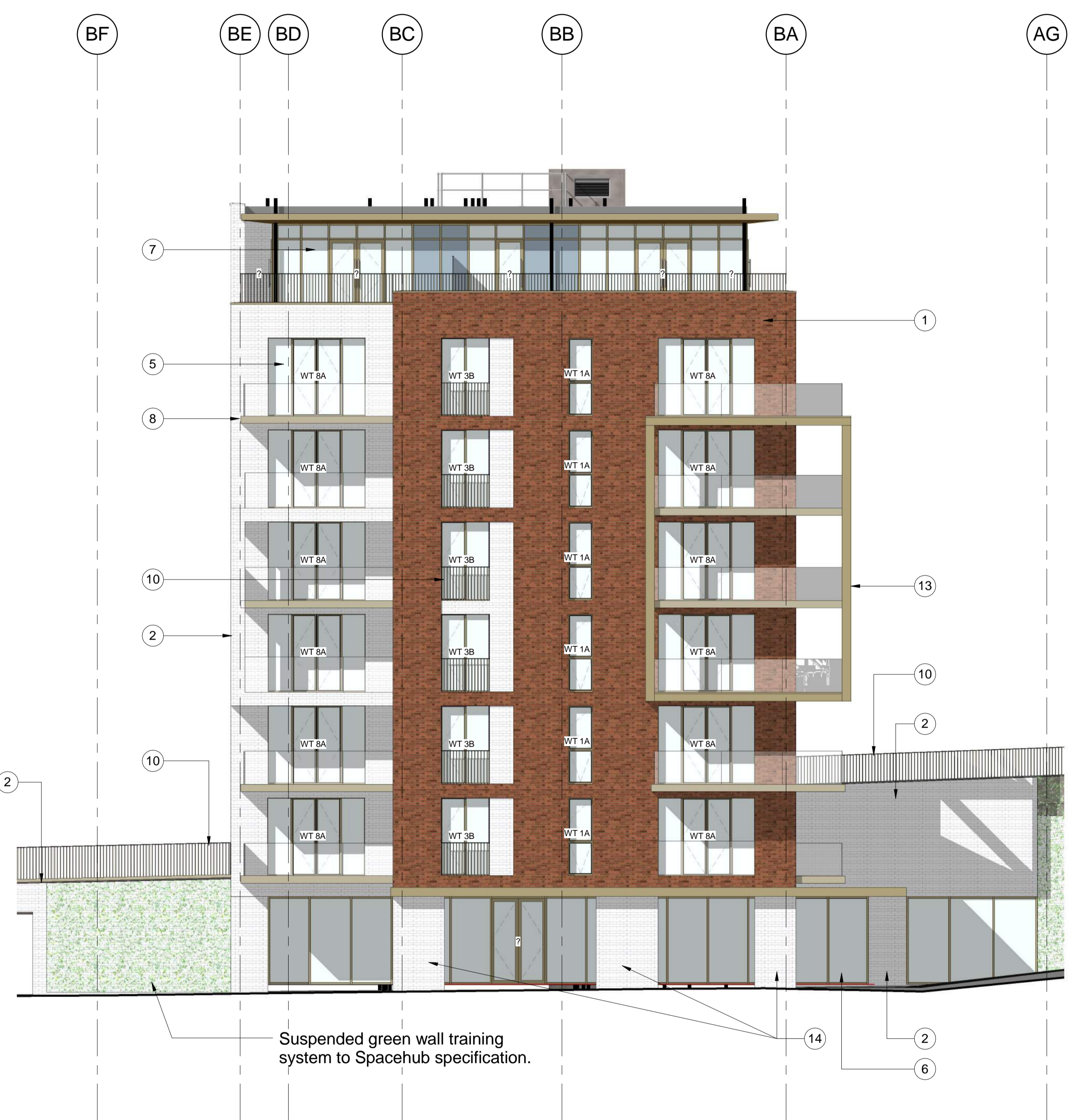
2 Block B South 1 : 100

Suspended green wall training system to Spacehub specification.