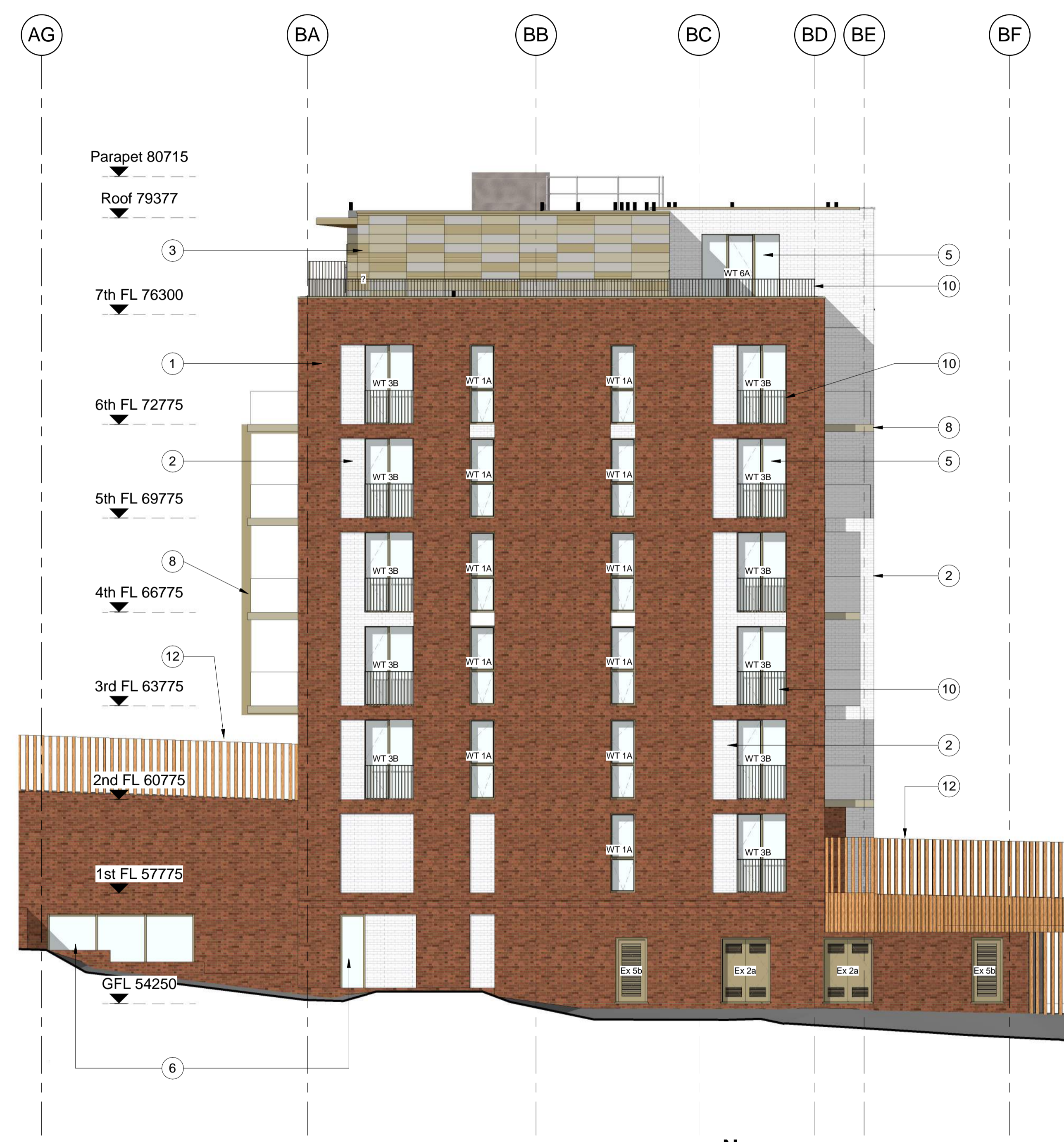
1 Block B North 1 : 100

Suspended green wall training system to Spacehub specification.