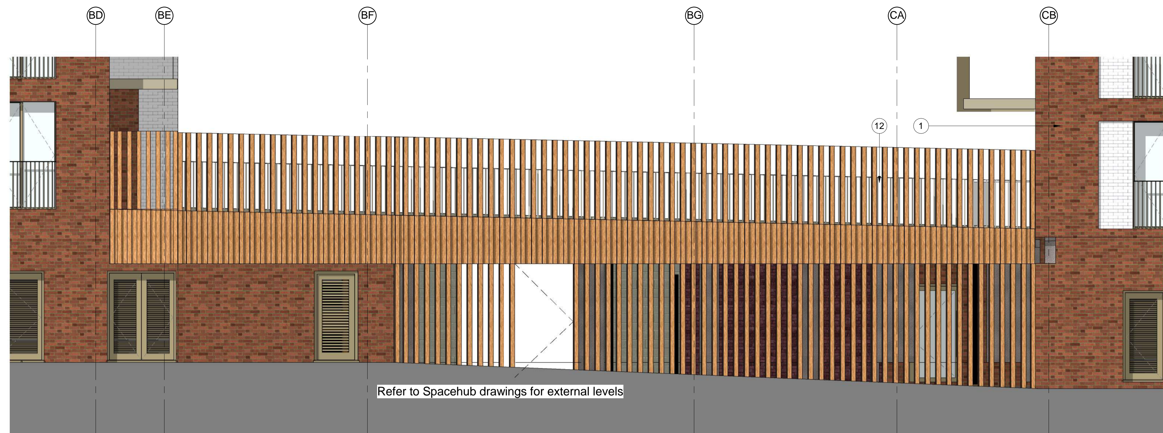
Block B-C Podium - North Elevation

This drawing is copyright and shall not be reproduced or used for any other purpose without the written permission of the Architects. It is the contractors responsibility to ensure full compliance with the Building Regulations. Do not scale from this drawing, use figured dimensions only. It is the contractors responsibility to check and verify all dimensions on site. Any discrepancies to be reported immediately. IF IN DOUBT ASK. Materials not in conformity with relevant British or European Standards/Codes of practice or materials known to be deleterious to health & safety must not be used or specified on this project. Materials known to contain asbestos contaminated materials (ACM's) in the manufacture or installation process have not been specified and must not be used on this project.