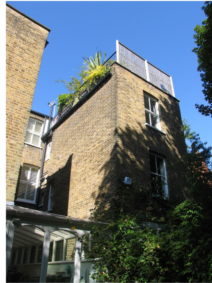
existing site photograph showing neighbours existing roof terrace