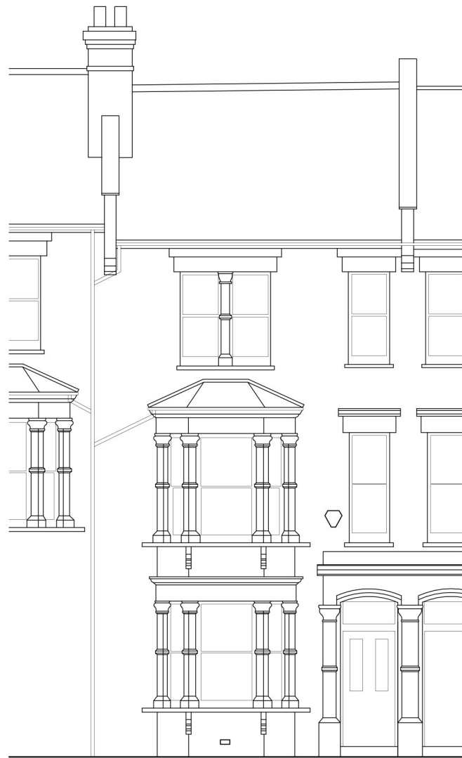
48 courthope road