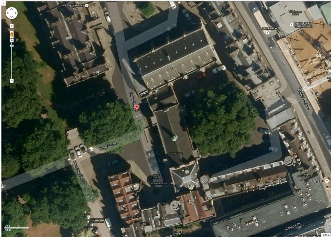
Lincoln's Inn Estate

The Old Hall is located within Lincoln's Inn.