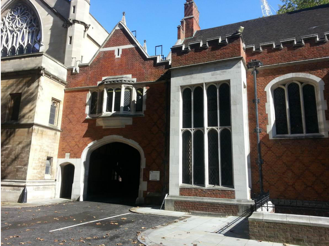
View to Old Hall and attached gateway front elevation.