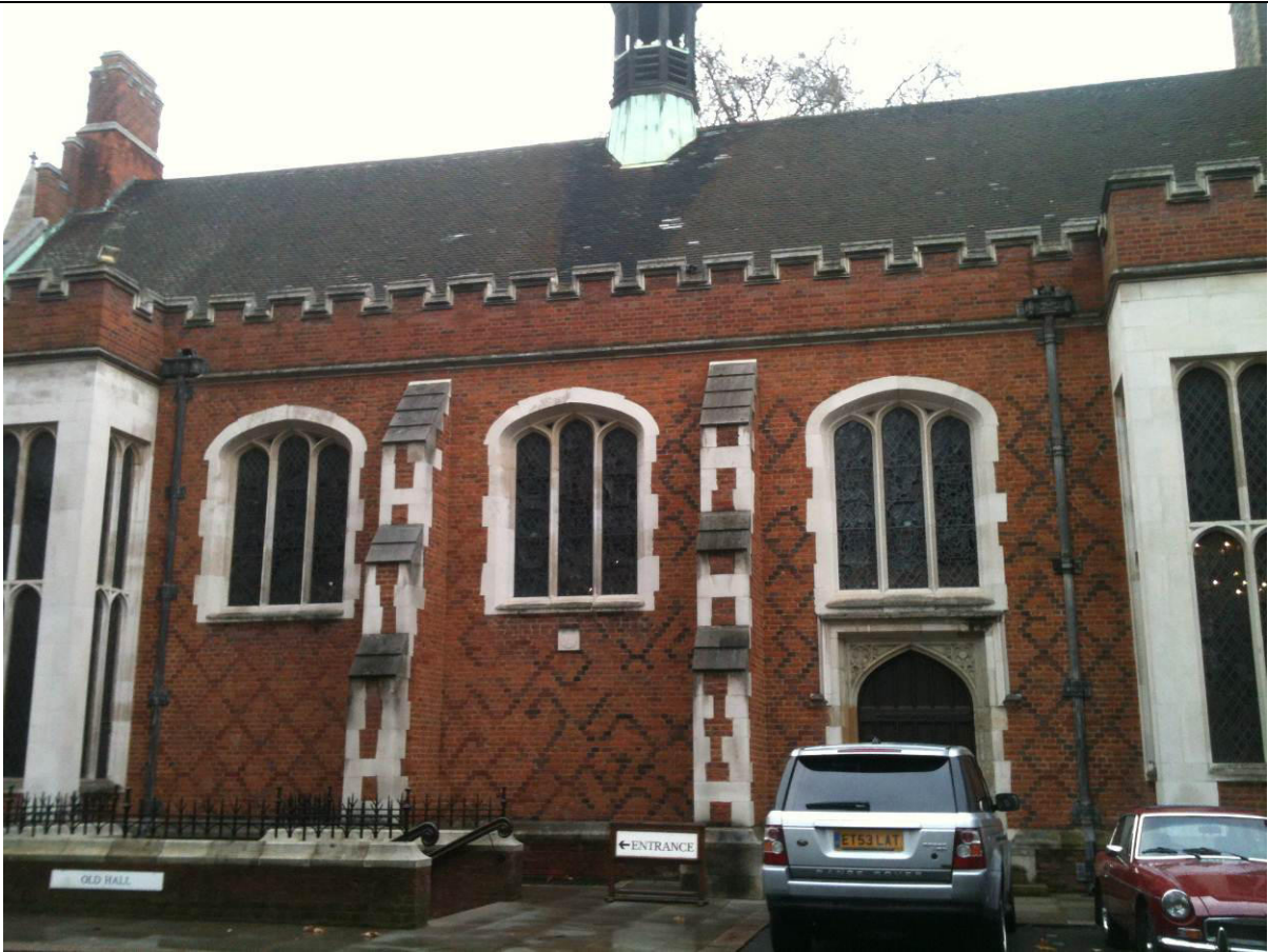
View of Old Hall, front elevation ground level.