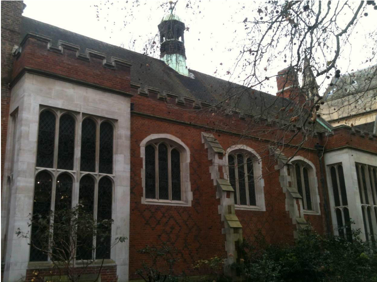
View of Old Hall, Rear elevation.