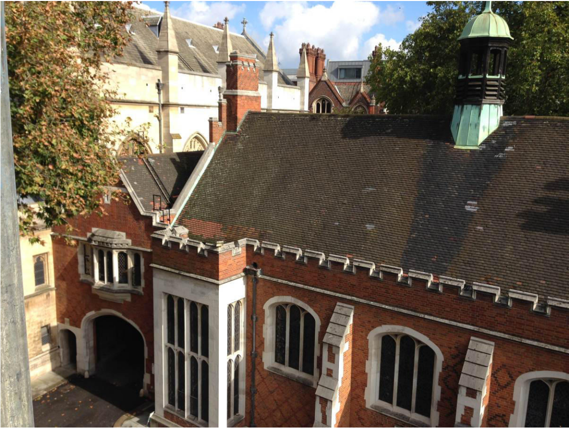
View of Old Hall roof level, front elevation.