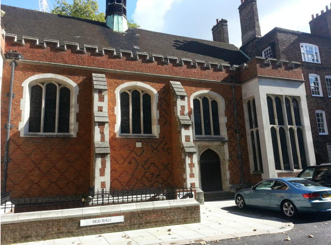
View of Old Hall and adjoining building front elevation.