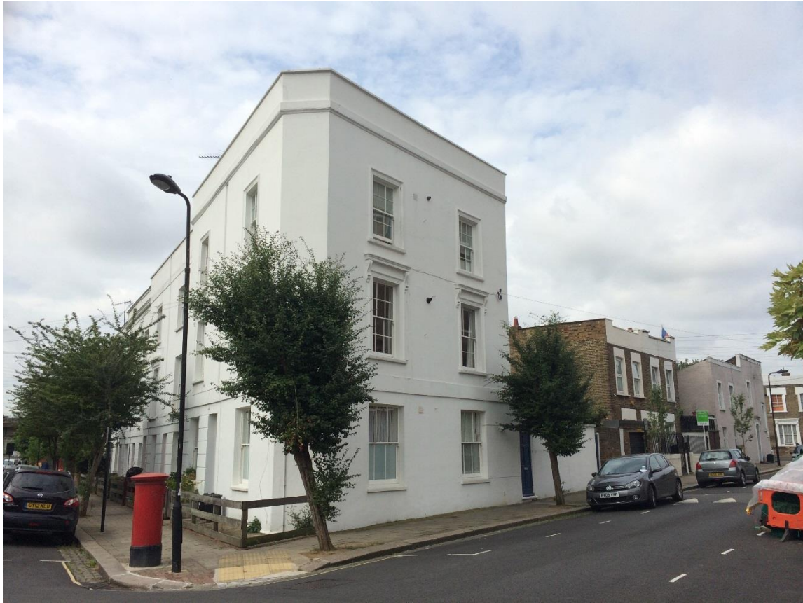
3. Flank (North) Elevation – 71-81 Hartland Road

71-81 Hartland Road, London, NW1 8DE Planning Application: PP 03859749