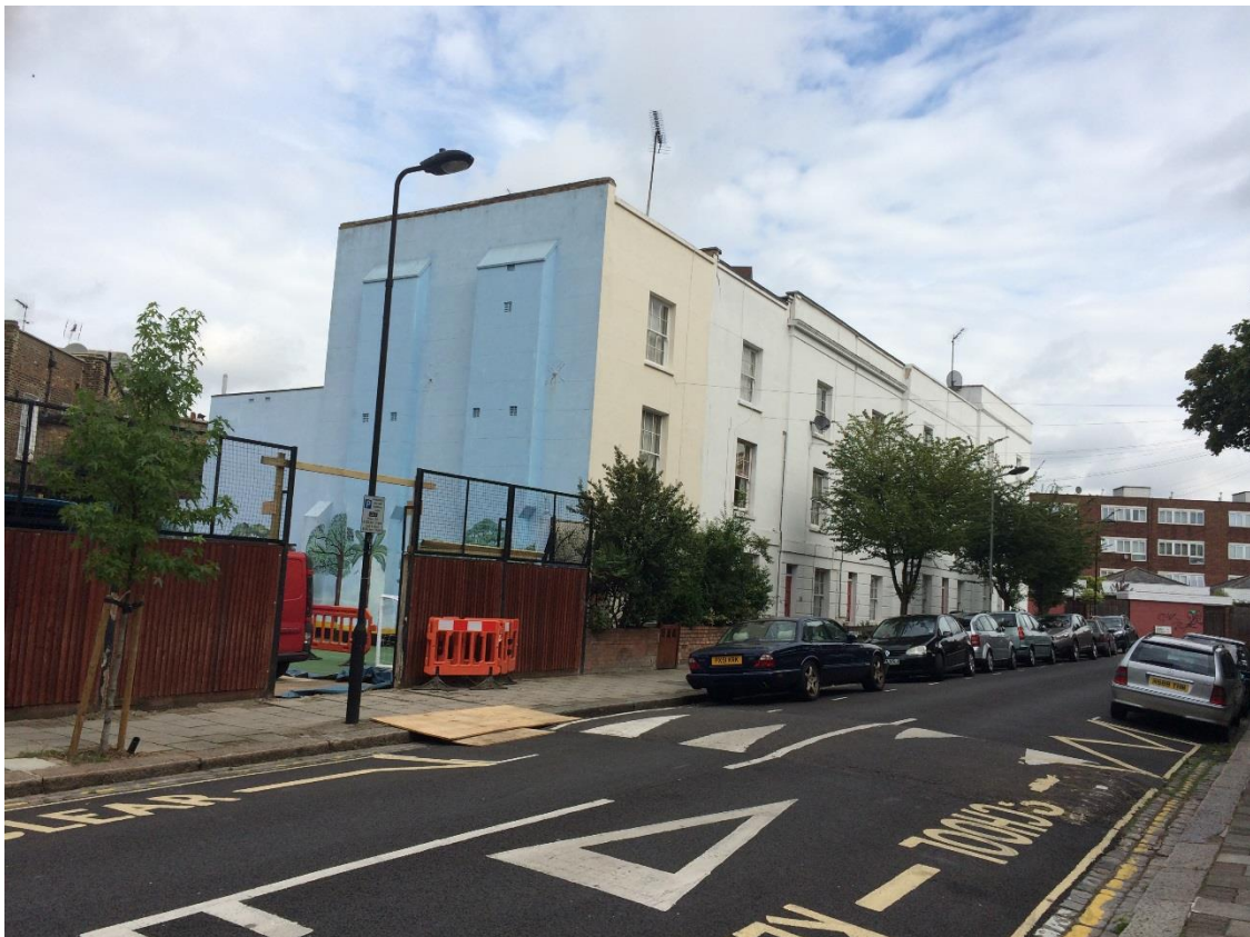
2. Front (South East) Elevation – 71-81 Hartland Road