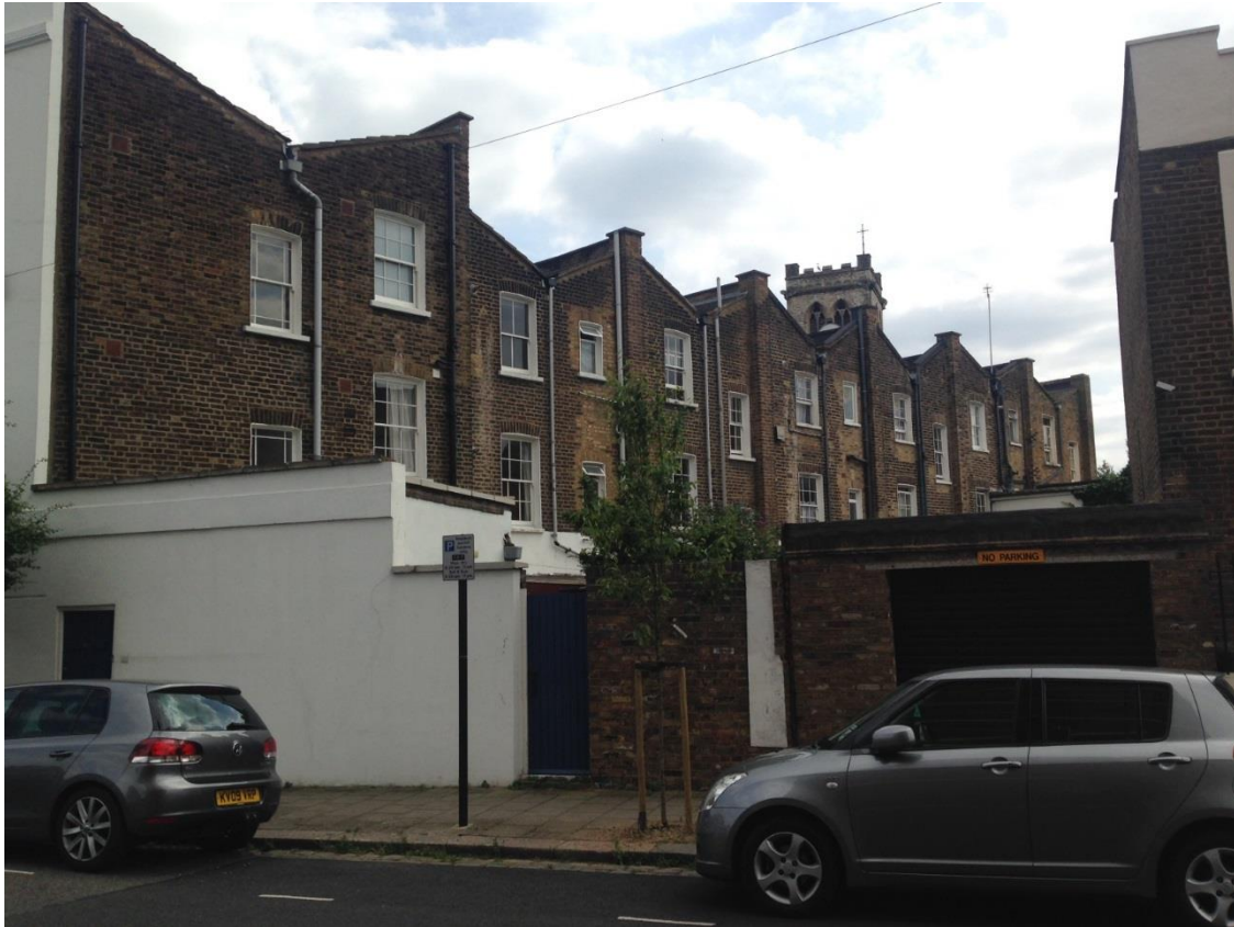
1. Rear (North West) Elevation – 71-81 Hartland Road