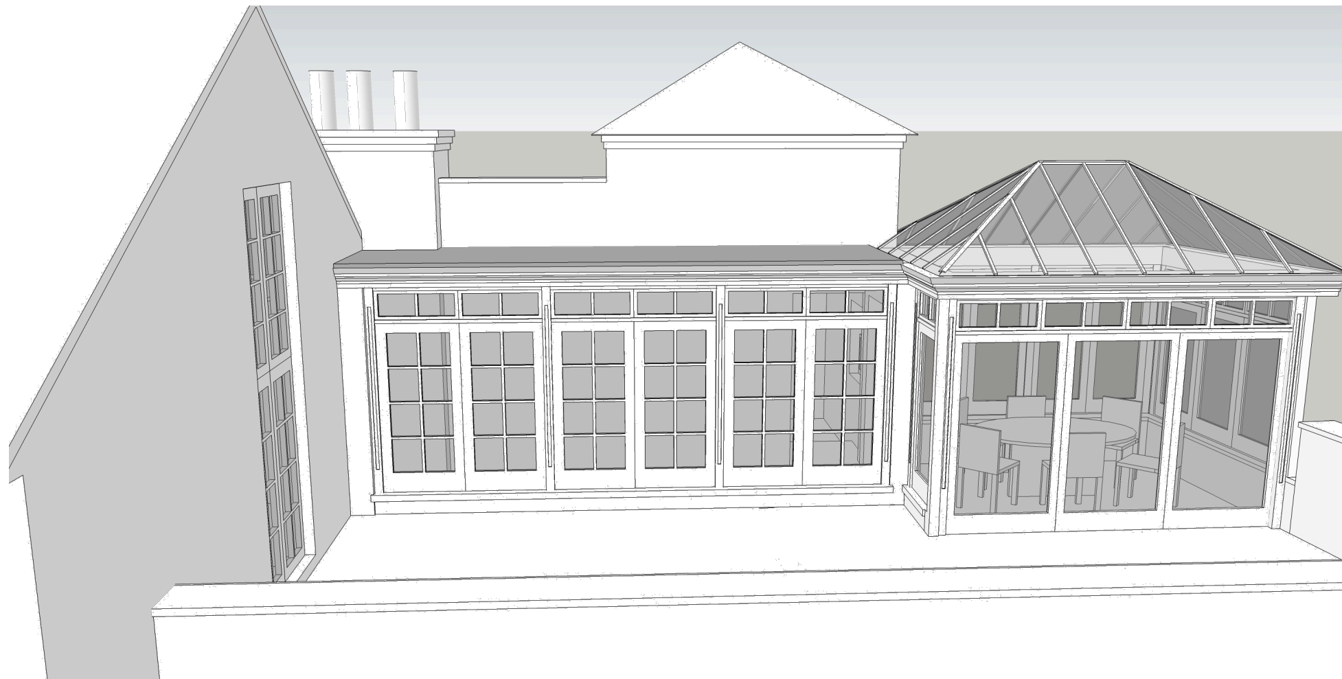
New glass link and conservatory - East elevation