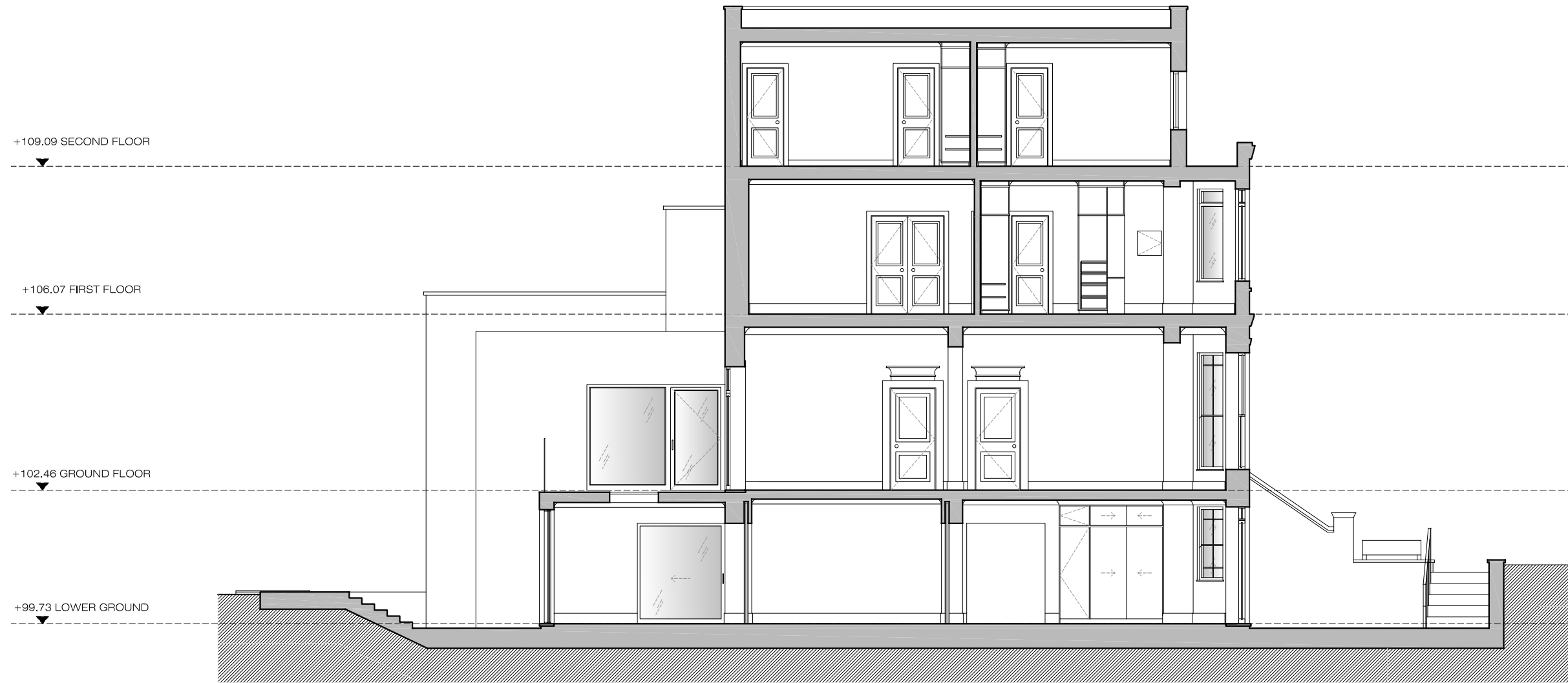
01 Section BB scale: 1:100 14_09