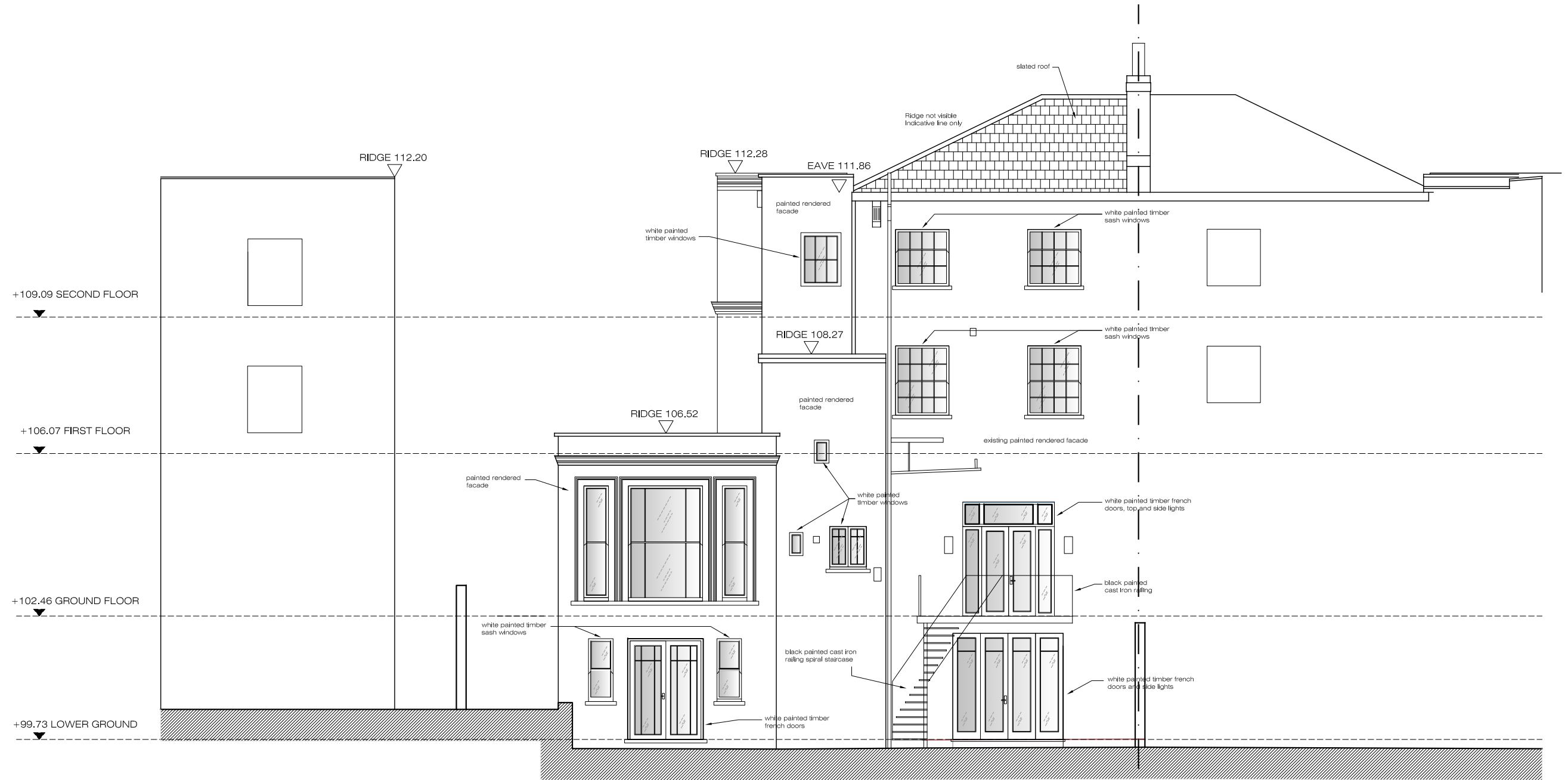
01 Rear Elevation scale: 1:100 14_09