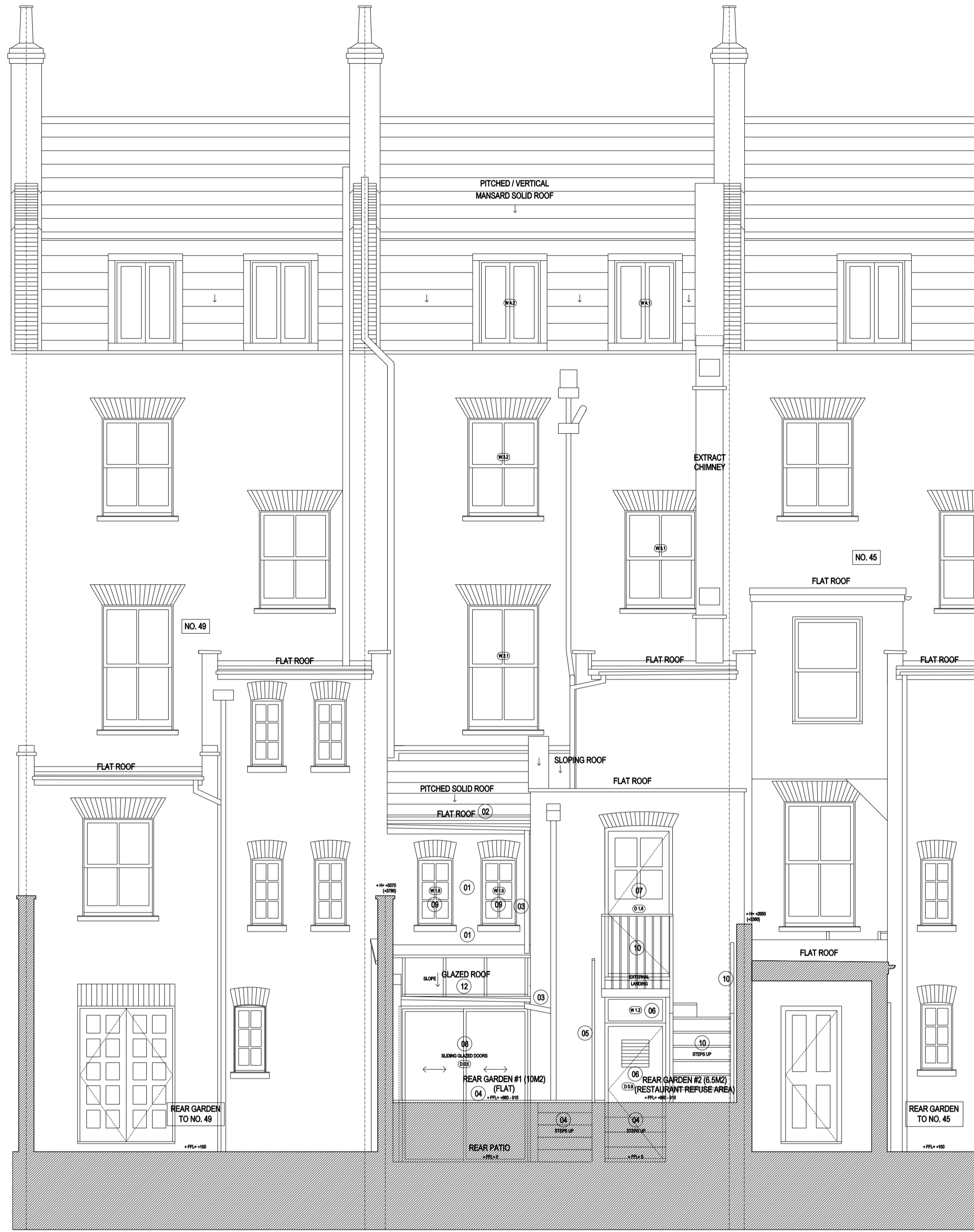
04 PROPOSED REAR ELEVATION 04 (15-11-03) Scale 1:50 (@A1 SIZE)