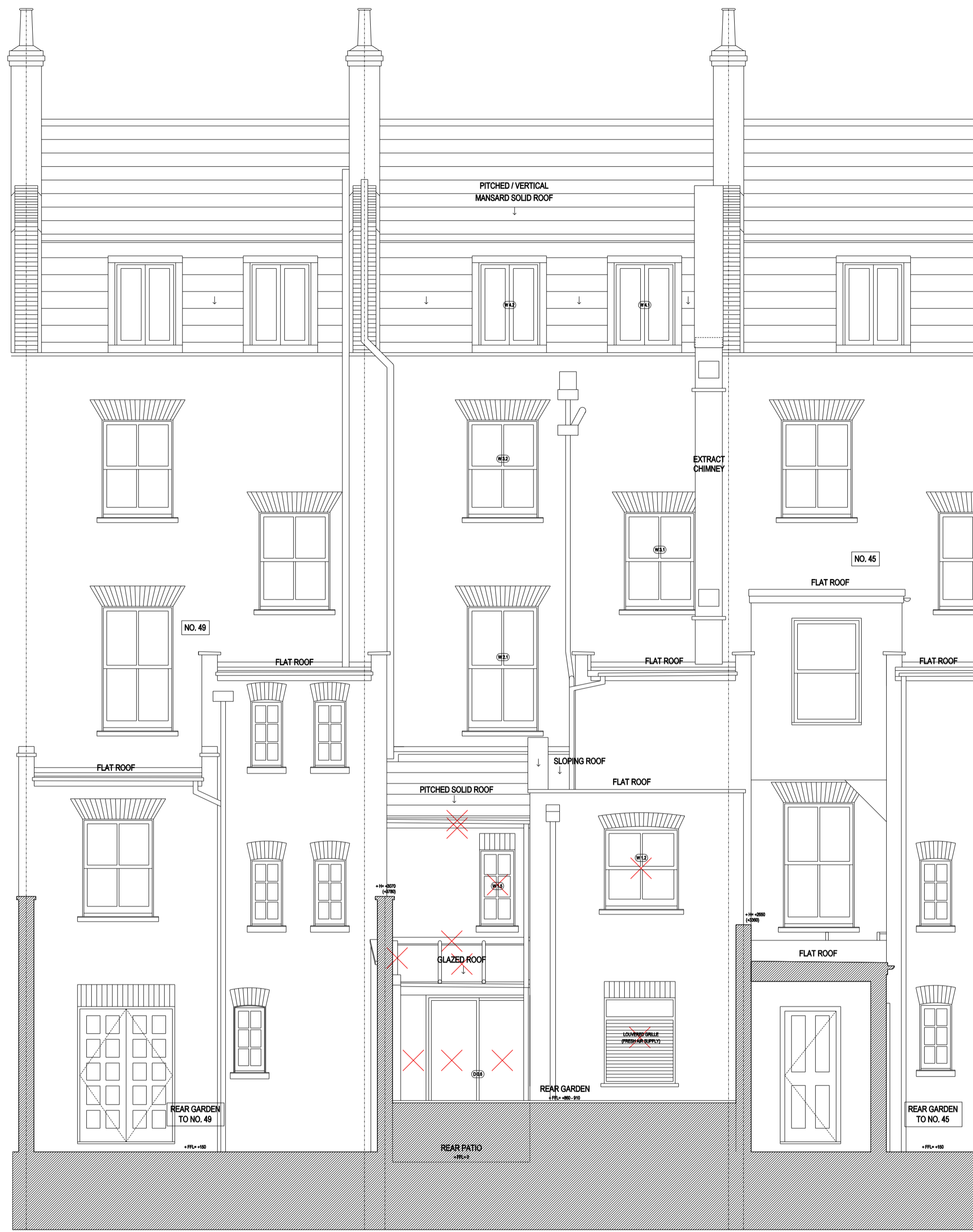
04 EXISTING REAR ELEVATION 04 (15-01-03) Scale 1:50 (@A1 SIZE)