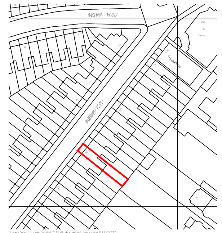
LOCATION PLAN ~ 1:1250