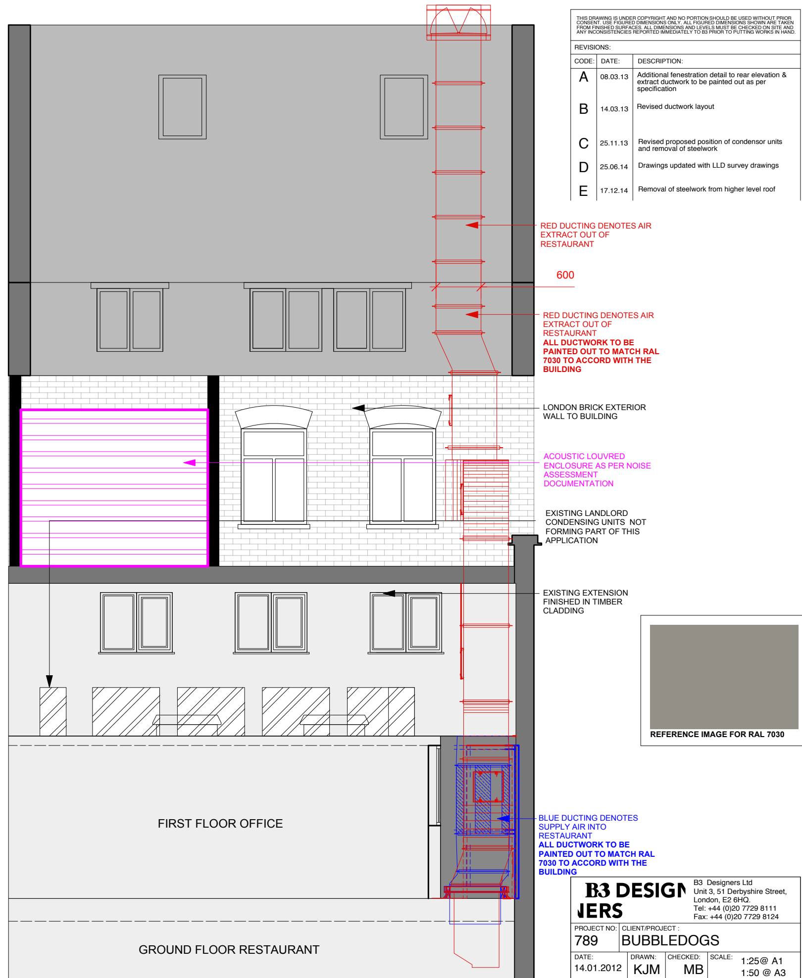
789 - ELEVATION CC SCALE 1:50 @ A3