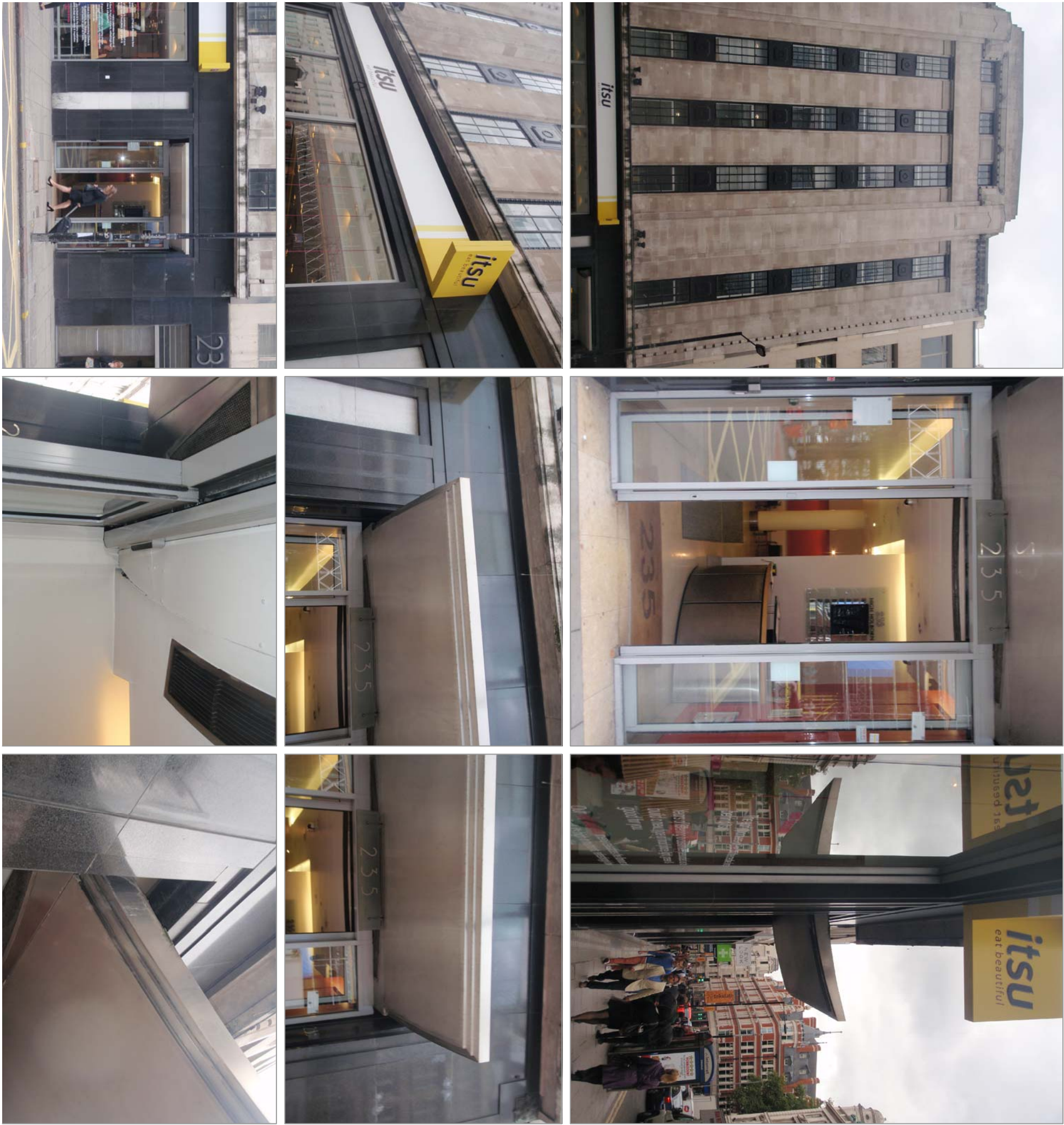
EXISTING ENTRANCE DOORS & CANOPY Scale 1:20 @ A1

Solid Canopy over entrance doors extending 1175mm approx from face of building