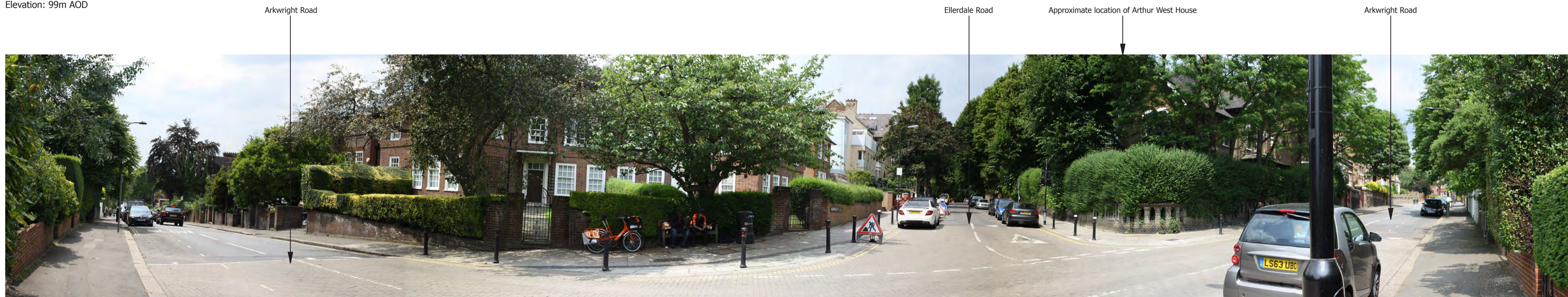
SITE CONTEXT PHOTOGRAPH 17: VIEW FROM ARKWRIGHT ROAD JUNCTION WITH ELLERDALE ROAD, LOOKING NORTH