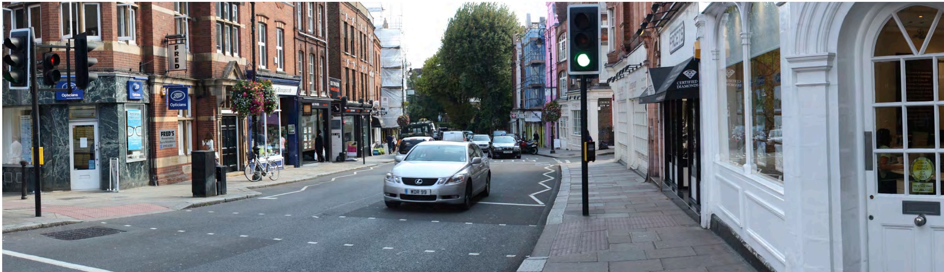
ACTUAL SIZE EXTRACT: RECOMMENDED VIEWING DISTANCE @A3 300MM