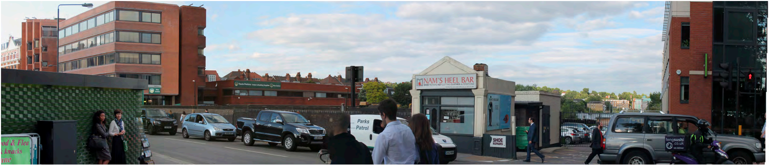
SITE CONTEXT PHOTOGRAPH 22: VIEW FROM BRIDGE OVER THAMESLINK RAIL LINE IN WEST HAMPSTEAD, LOOKING NORTH EAST