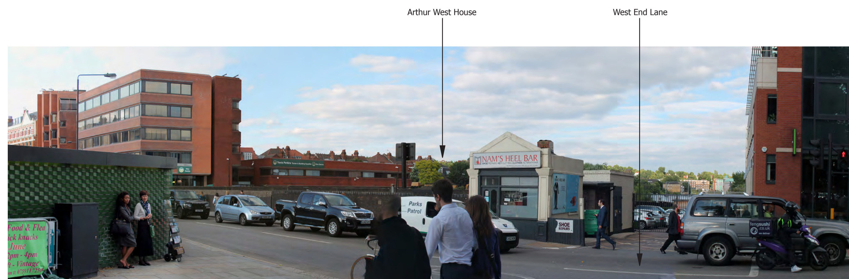
SITE CONTEXT PHOTOGRAPH 21: VIEW FROM BRIDGE OVER THAMESLINK RAIL LINE IN WEST HAMPSTEAD, LOOKING NORTH EAST