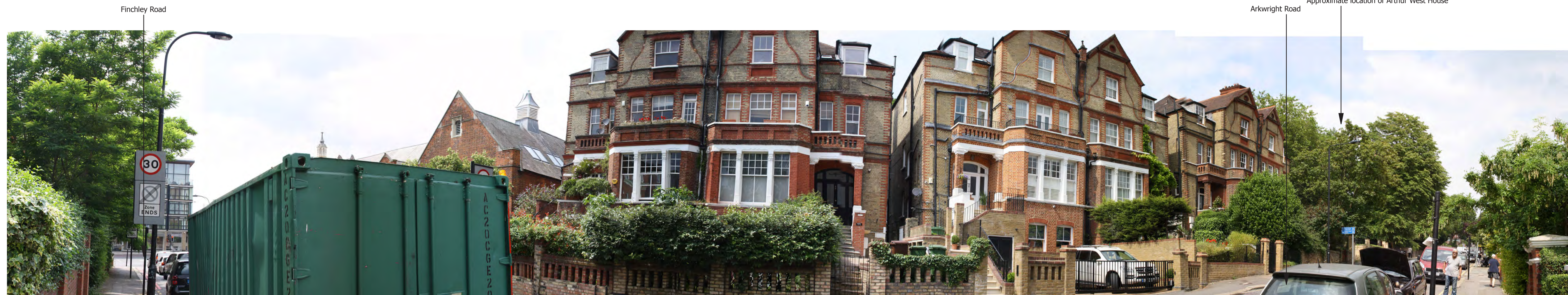
SITE CONTEXT PHOTOGRAPH 19: VIEW FROM ARKWRIGHT ROAD, IN THE VICINITY OF JUNCTION WITH FINCHLEY ROAD, LOOKING NORTH-EAST