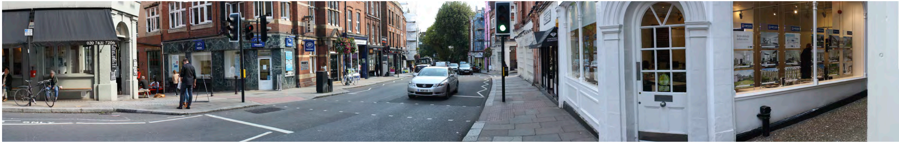
SITE CONTEXT PHOTOGRAPH 12: VIEW FROM FITZJOHN'S AVENUE, LOOKING SOUTH