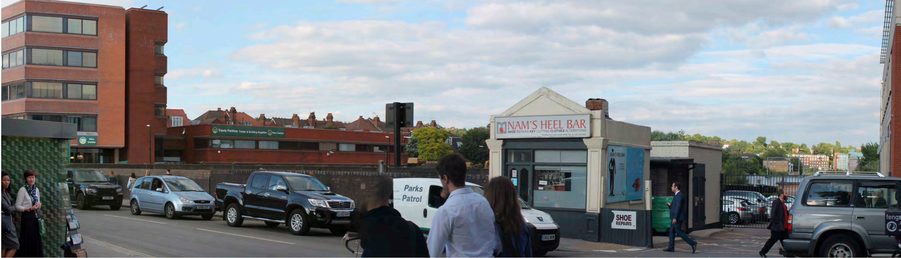
ACTUAL SIZE EXTRACT: RECOMMENDED VIEWING DISTANCE @A3 300MM