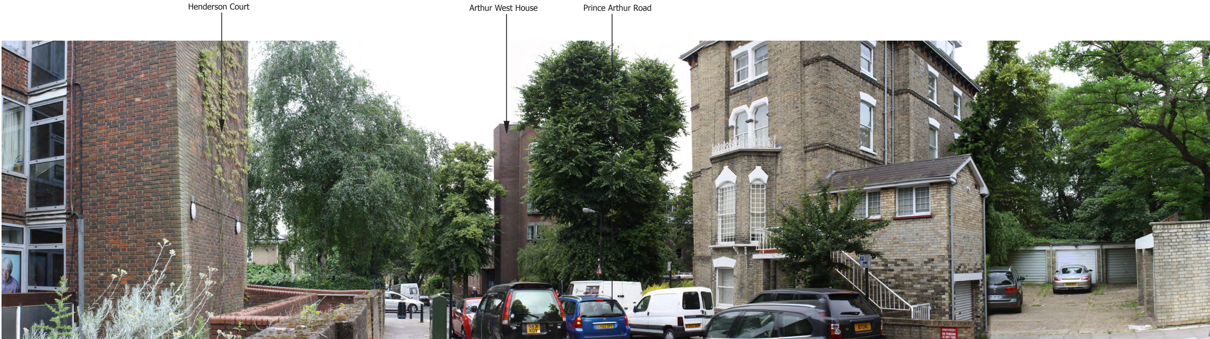
SITE CONTEXT PHOTOGRAPH 2: VIEW FROM PRINCE ARTHUR ROAD, ADJACENT TO HENDERSON COURT, LOOKING WEST