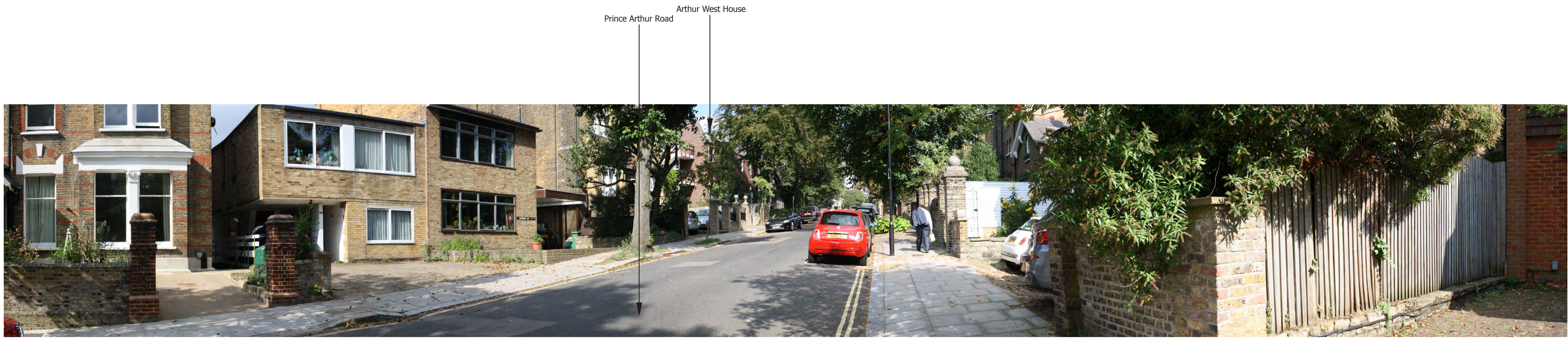
SITE CONTEXT PHOTOGRAPH 6: VIEW FROM PRINCE ARTHUR ROAD, LOOKING NORTH-EAST