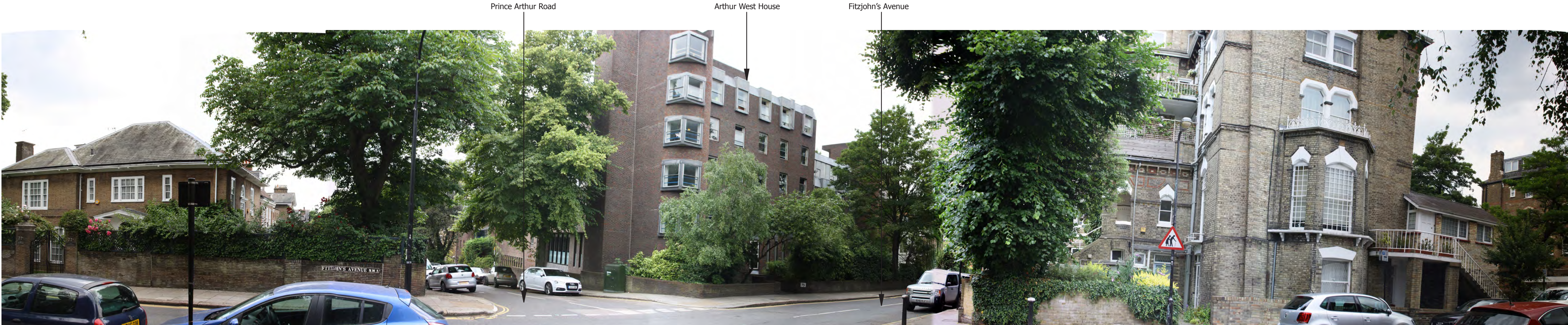
SITE CONTEXT PHOTOGRAPH 3: VIEW FROM PRINCE ARTHUR ROAD JUNCTION WITH FITZJOHN'S AVENUE, LOOKING NORTH-WEST