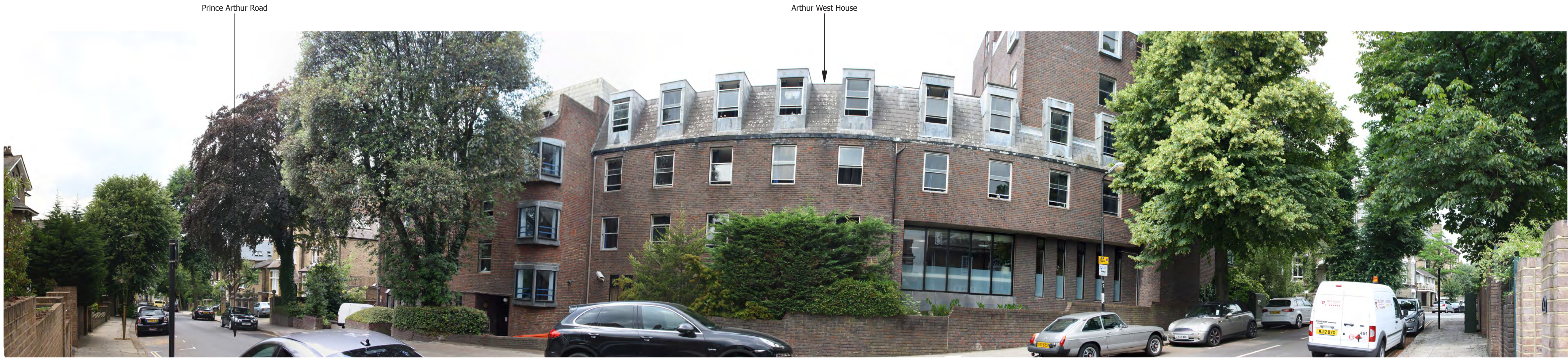
SITE CONTEXT PHOTOGRAPH 5: VIEW FROM PRINCE ARTHUR ROAD, LOOKING NORTH-WEST