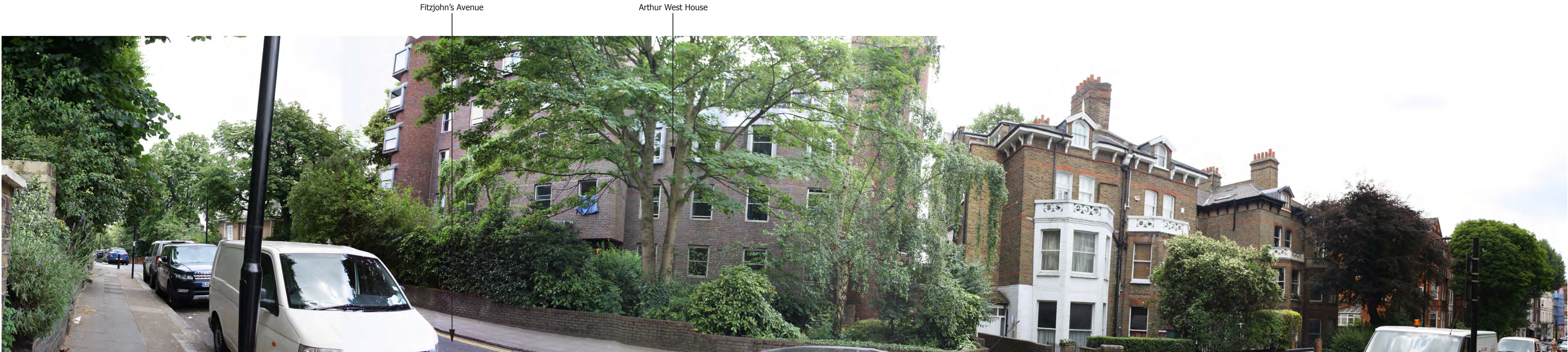
SITE CONTEXT PHOTOGRAPH 1: VIEW FROM FITZJOHN'S AVENUE, LOOKING SOUTH-WEST