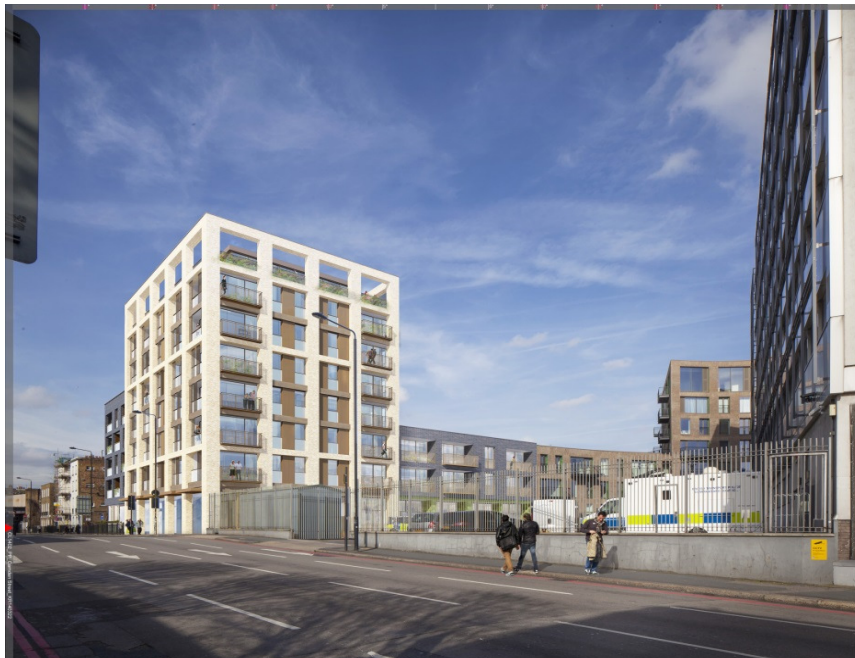
Fig 1 - Proposed Camden Street development

There is a requirement within the Borough for the residential flats to achieve Code Level 4, as well as 50% of the credits within the Energy, Water and Materials sections.