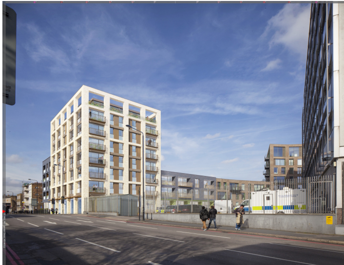
Fig 1 - 140-146 Camden Street

There is a target within the borough to achieve BREEAM Excellent, with 60% of the credits within the Energy and Water sections and 40% within the Materials section.