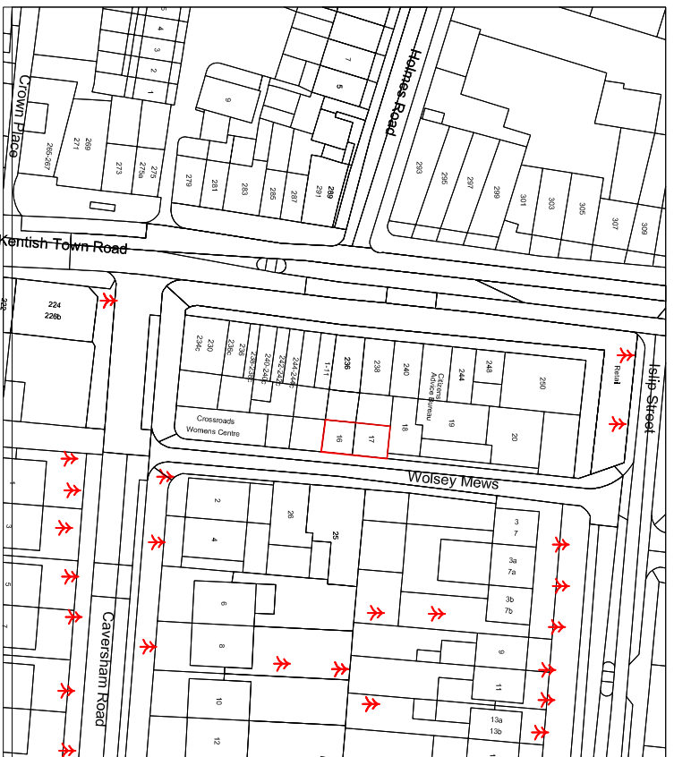
SITE PLAN 1:1250