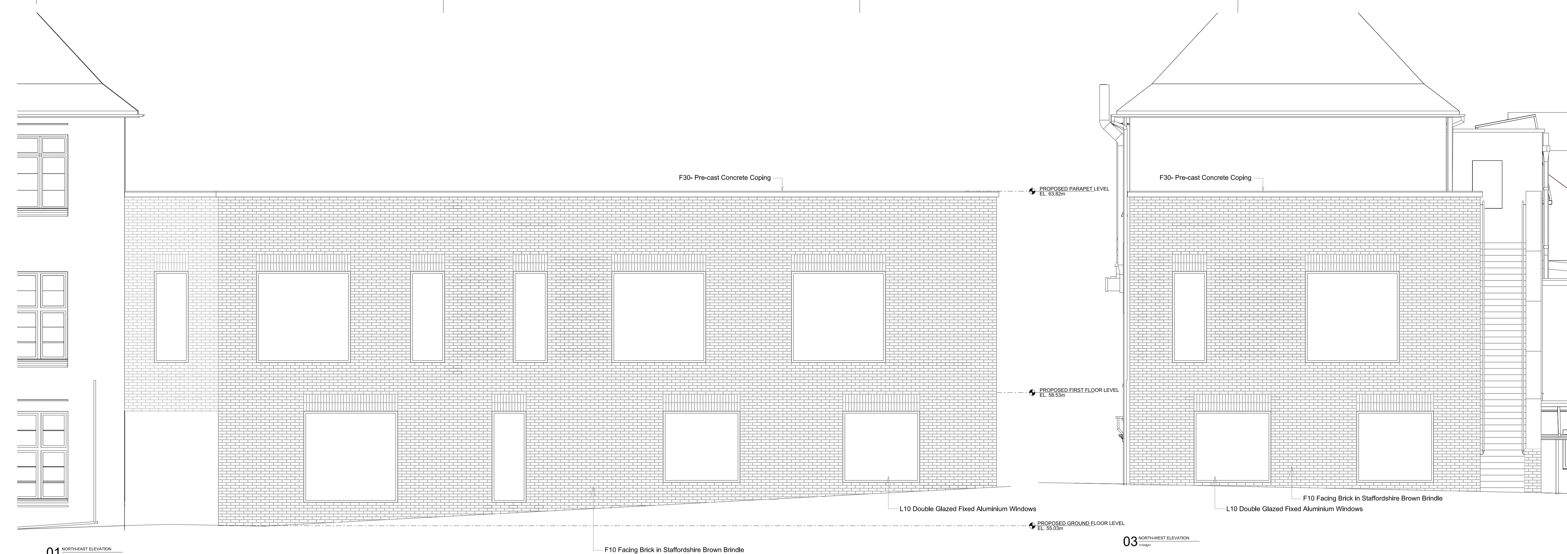
01 NORTH-EAST ELEVATION