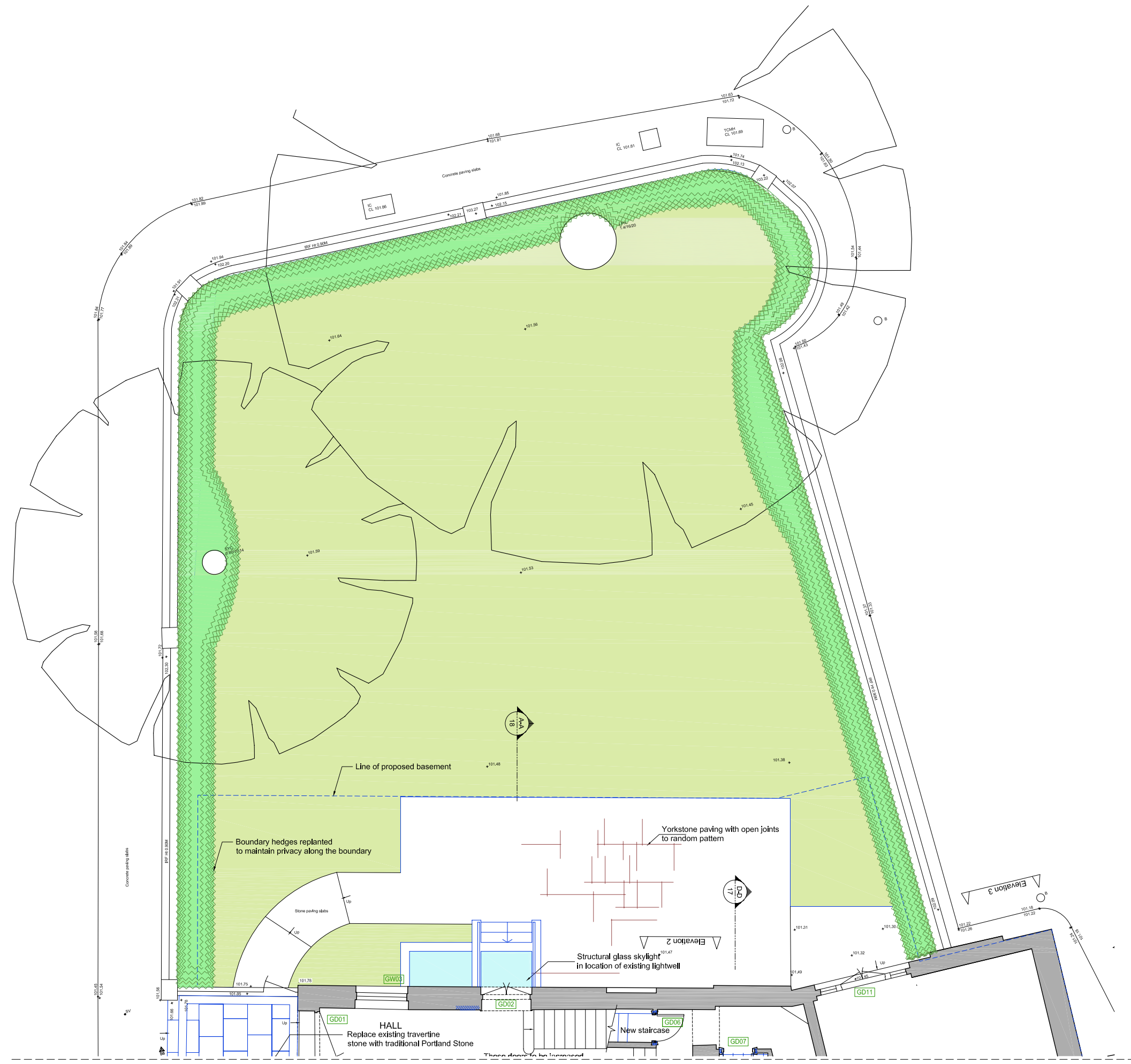
1 GARDEN PLAN SHOWING EXTERNAL WORKS 200 1:50