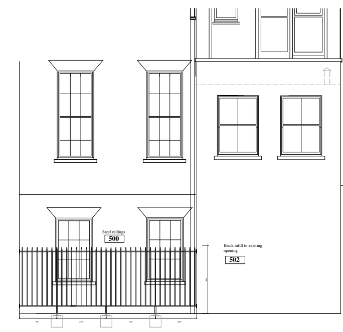
Courtyard Fence Elevation