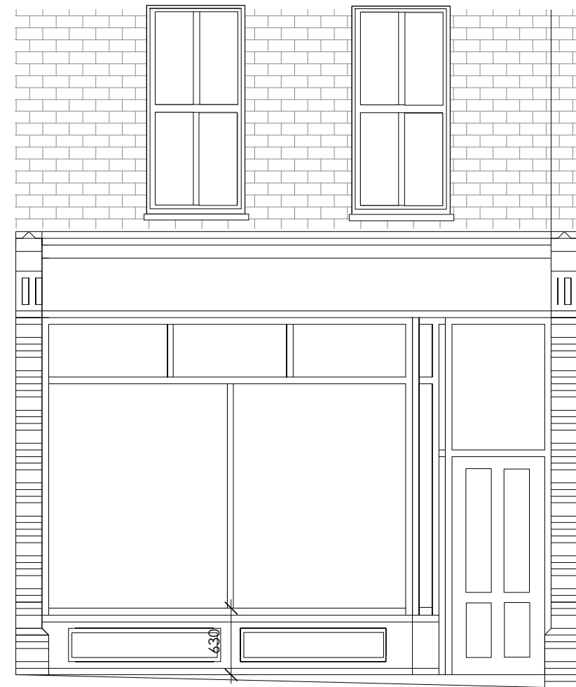
EXISTING SHOPFRONT ELEVATION