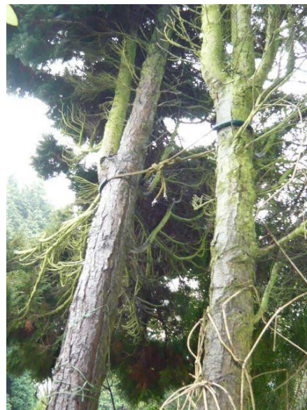
Photograph 4: Current wiring on T30