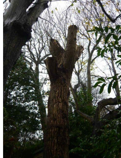
Photograph 6: Remaining Stump of T17

Web: www.landmarktrees.co.uk e-mail: info@landmarktrees.co.uk Tel: 0207 851 4544