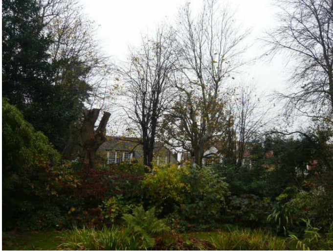
Photograph 5: Location of T17