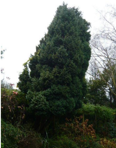
Photograph 1: Lean on T4