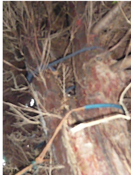
Photograph 2: Current wire around T4