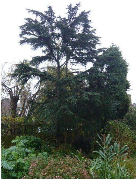
Photograph 3: T30 in current location