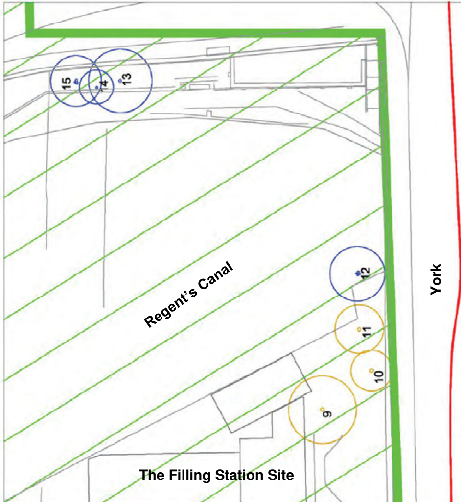
Figure 2 Location Plan which formed part of application ref. 2014/7366/T

As set out in application ref. 2014/7366/T, tree nos. 10, 11, 12, 13, 14 and 15 (identified on the below location plan which formed part of application ref. 2014/7366/T) will be retained and no works are proposed to these trees at the current time.