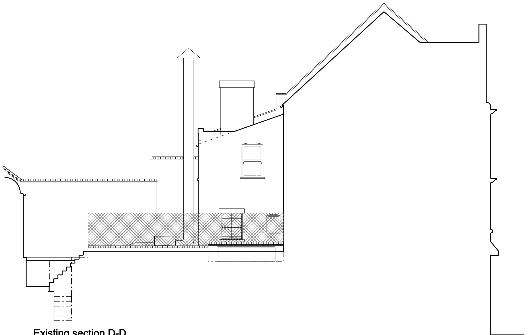
Existing section D-D