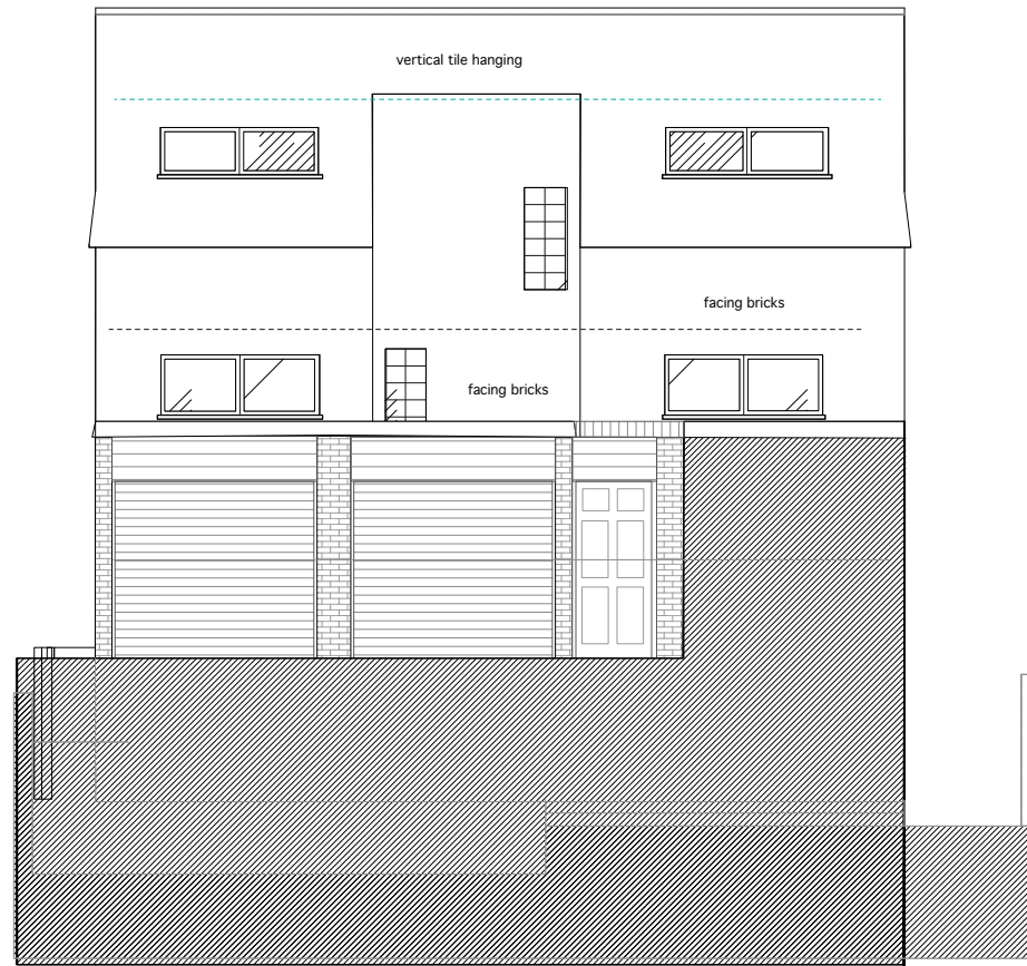
EAST FRONT ELEVATION