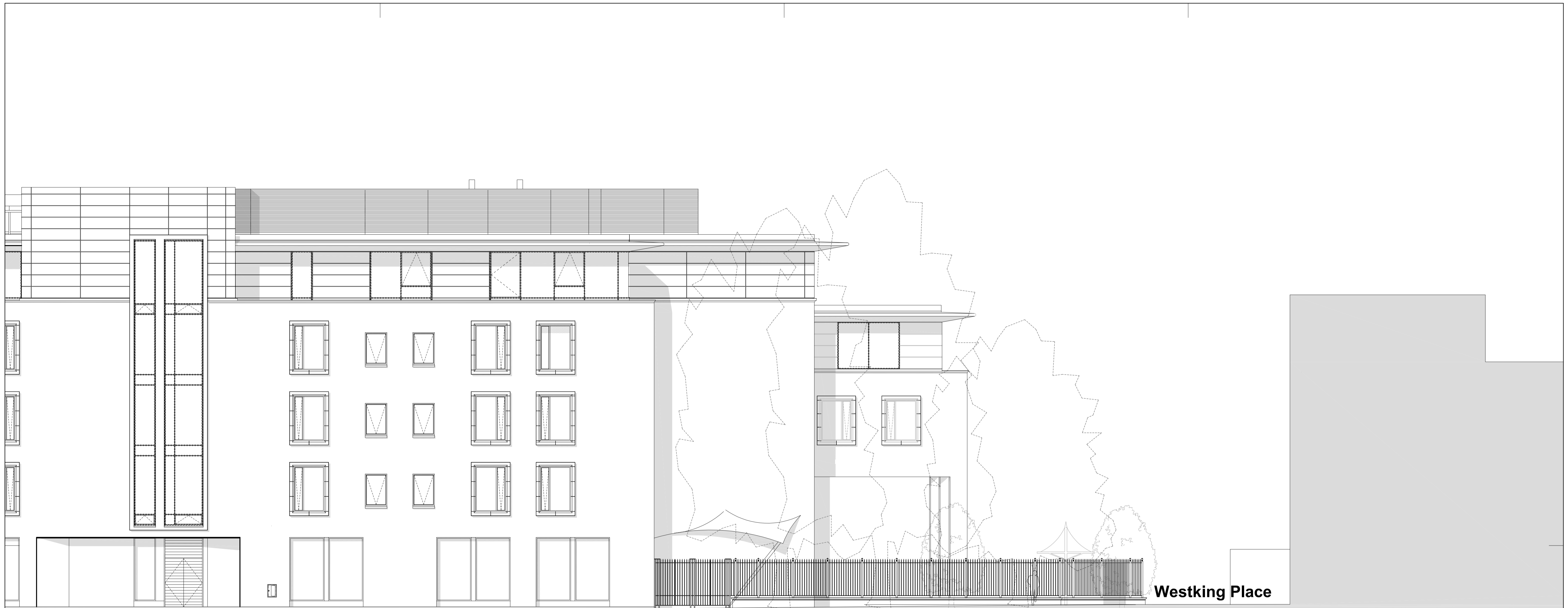
Existing Sidmouth Street Elevation