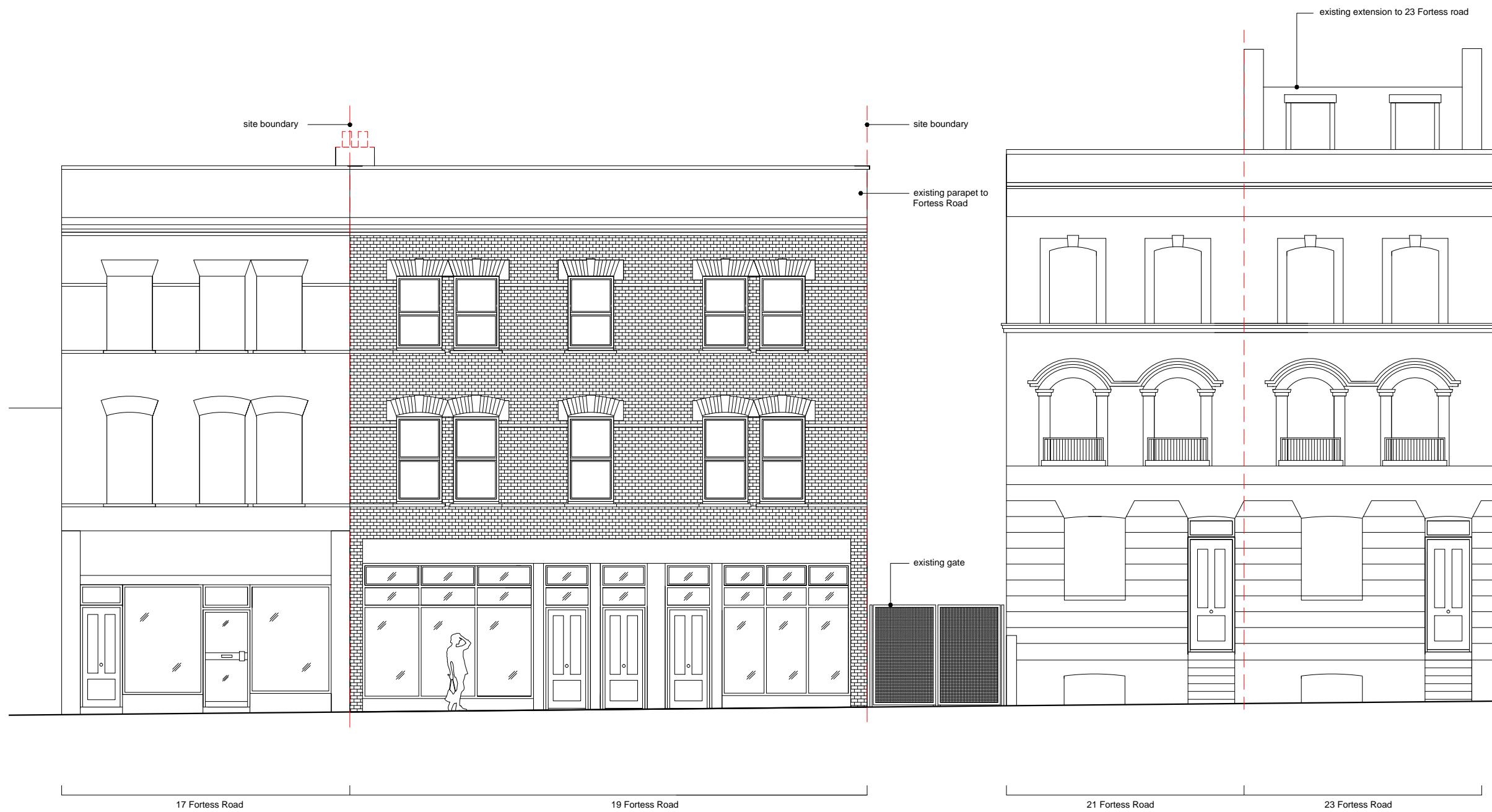
Existing front elevation Scale 1:100 @A3