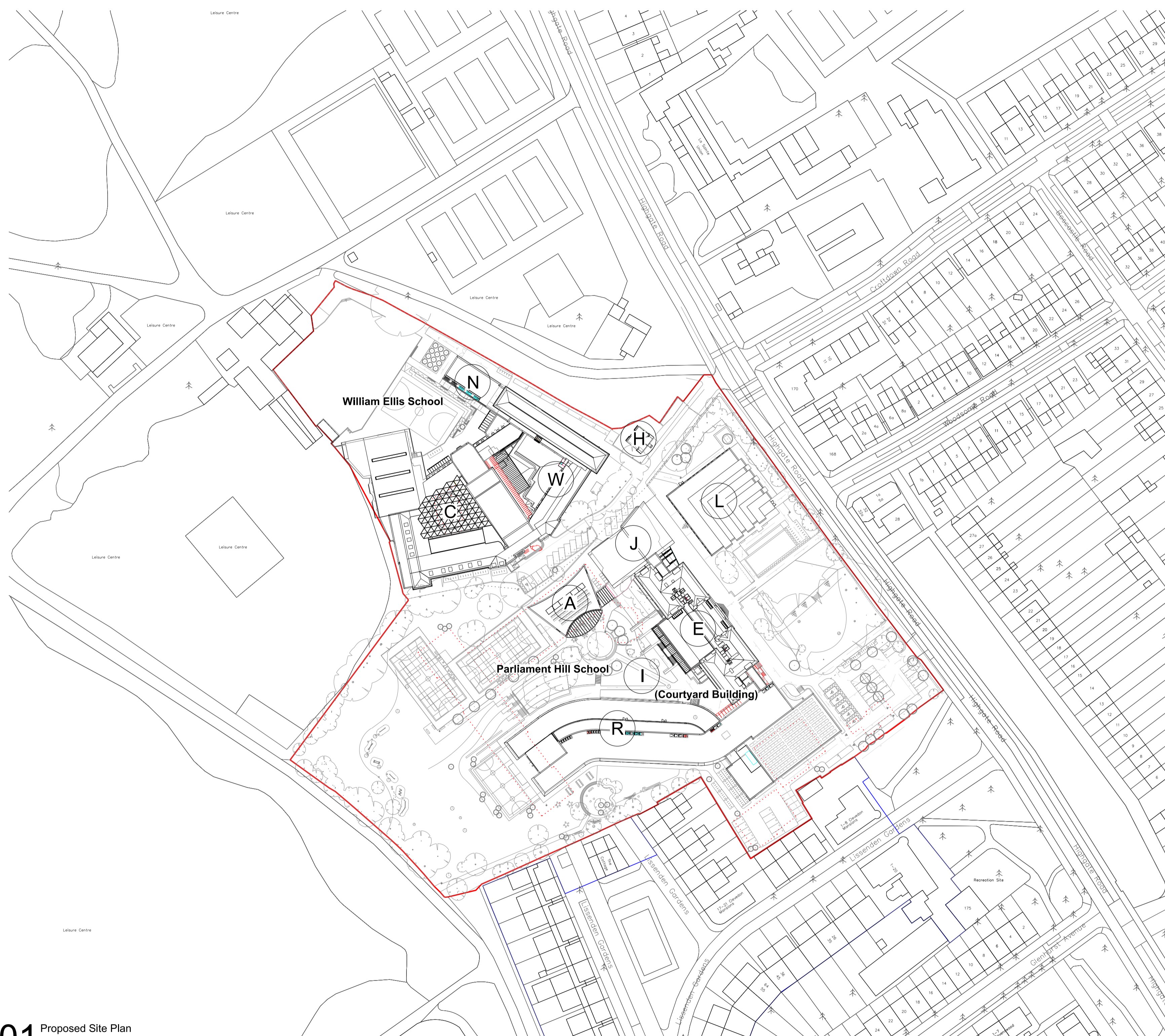
01 Proposed Site Plan 1:1000