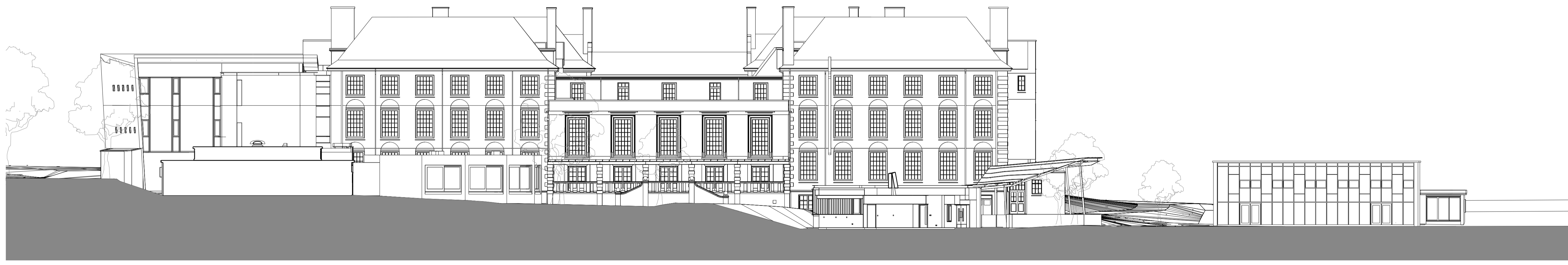
07 EXISTING SOUTH WEST ELEVATION B 1:200