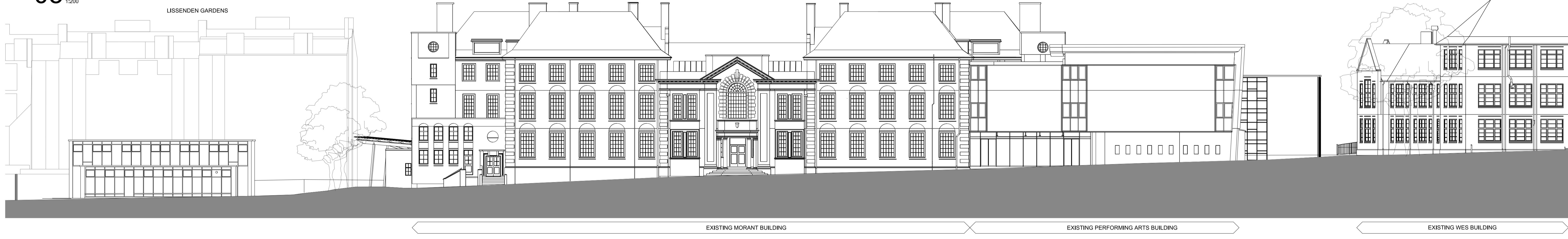
06 EXISTING NORTH EAST ELEVATION 1:200