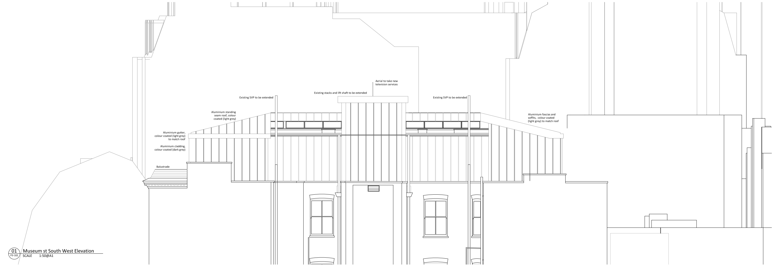
01 Museum st South West Elevation SCALE 1:50@A1

NOTES CONSULTANTS - Refer to highways consultant's drawings for details - Refer to landscape consultant's drawings for details - Landscaping layout is indicative only AREAS - Refer to area schedule PLANNING © Copyright Reserved, ColladoCollins Partners LLP