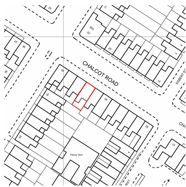
01- OS MAP 1:1250