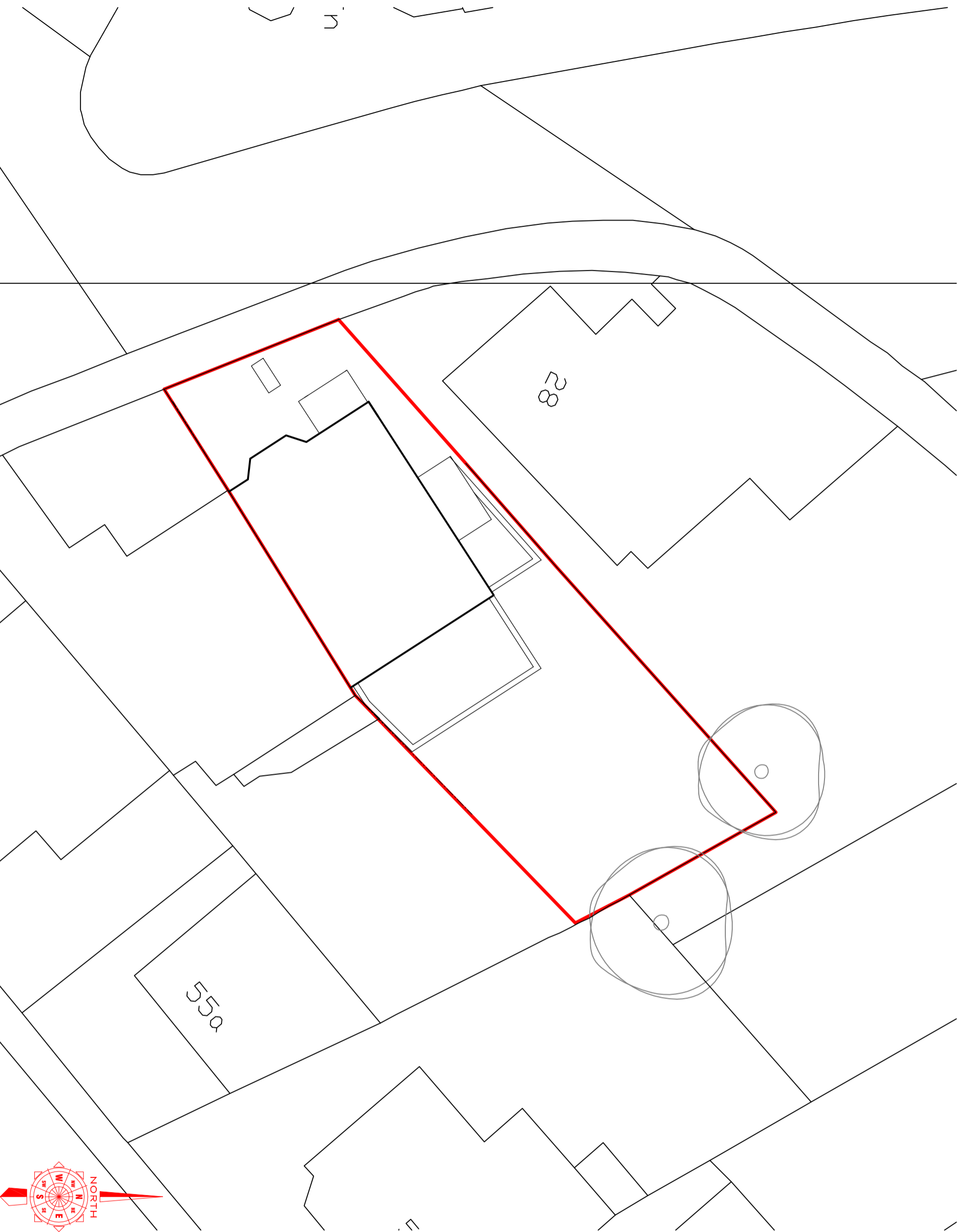
Proposed Site Plan 1:200